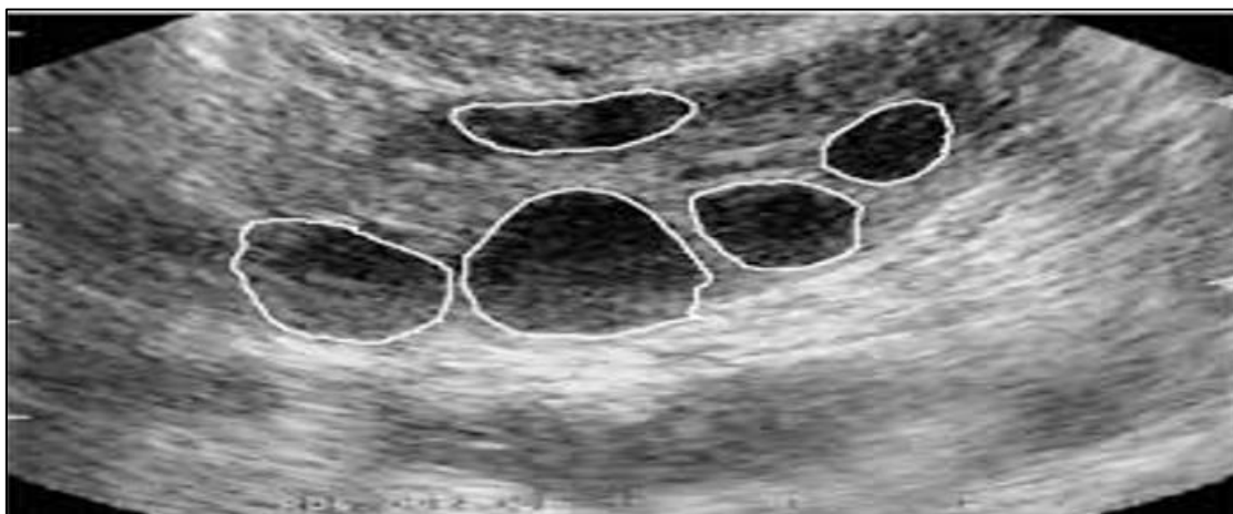
Fig 2. Follicle Detection Picture