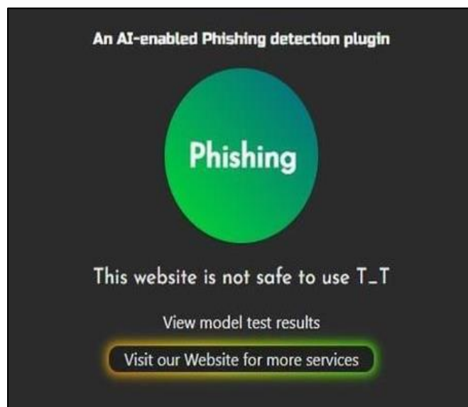
Fig 2: Example for Web-Based Extension

The system was tested on a database of URLs that were not available at runtime. Performance metrics used include precision, recall, and F1 score. These metrics show that the system can correctly identify phishing URLs while minimizing the negative impact. 95.6% URL accuracy was achieved. This high accuracy demonstrates the model's performance in correctly identifying phishing attempts. Detection now ensures that users are immediately alerted to threats, thus increasing their online provides an additional layer of security without affecting their counter these threats, future work should focus on implementing activities high Accuracy, Real time detection and Browser Extension Deployment are the most important aspects of the project.