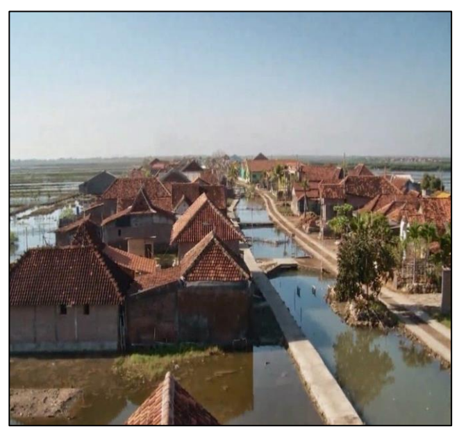
Fig 2: Condition of Timbulsloko

Based on interviews conducted by Audhea (2023) with the people of Timbulsloko Village, it was stated that Timbulsloko village was previously a rice field area where many crops were planted, but in 2012 some of the rice fields could no longer be planted because sea levels began to rise which caused several rice fields to be converted. function as a pond. Until 2017, rising sea water caused all of the pond land to be submerged and could not be sown with seeds again. Not only ponds, residents' houses and a number of other public facilities such as places of worship were also submerged by tidal floods. According to Astra (2014), the 2000s saw the beginning of land erosion in Timbulsloko Village, and in 2013 Timbulsloko Hamlet experienced land decline of around 400-1300 meters in its coastal area. This is what has caused the shift in land function that occurred in Timbulsloko Village from agricultural land to fish ponds and until now the pond land can no longer be planted with seeds.