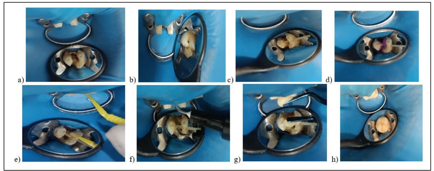
Fig 3: a)Occlusal view of Postendodontically Treated Tooth(26); b)Buccal view of Hole Preparation for Horizontal Post Placement; c)1 Horizontal Post Placement; d)Etching; e)Bond Agent Application; f)Flowable Composite Application; g)Posterior Composite Placement; h)Postoperative Image