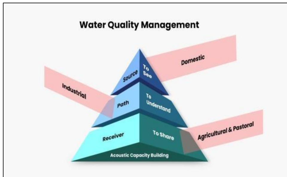
Fig-1 Water Quality Management