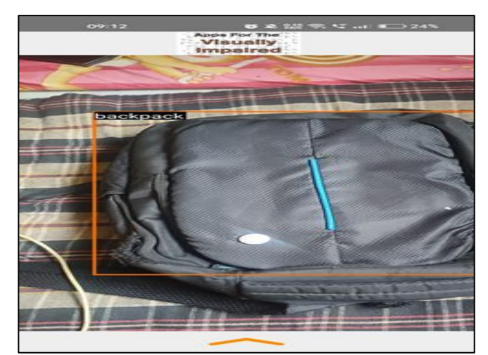
Fig 6 Object Detection