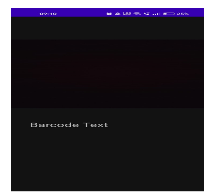
Fig 1 Barcode Reader

A barcode reader feature enables users to scan barcodes using their device's camera. Upon scanning, the application interprets the barcode data, which could include product information, pricing, or other relevant details. It's commonly used in shopping apps for price comparison, inventory management, or product identification.