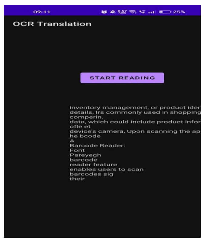
Fig 8 Text Reader