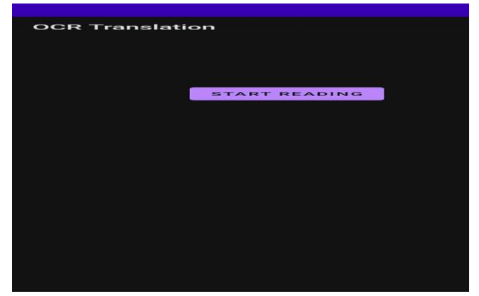
Fig 7 Text Reader

Text reader is the process of automatically identifying and extracting text from images or documents. It facilitates tasks such as converting printed text into digital format (OCR), translating languages, enabling augmented reality overlays, and improving accessibility for visually impaired individuals