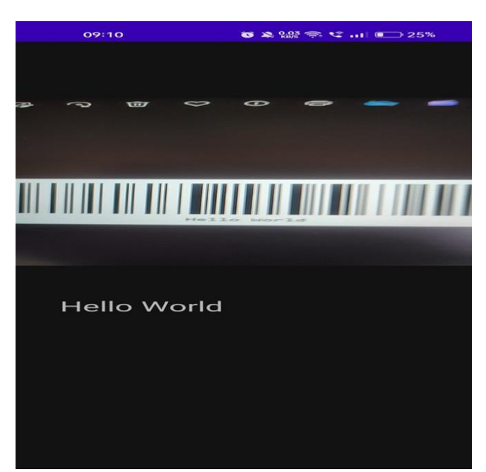
Fig 2 Barcode Reader