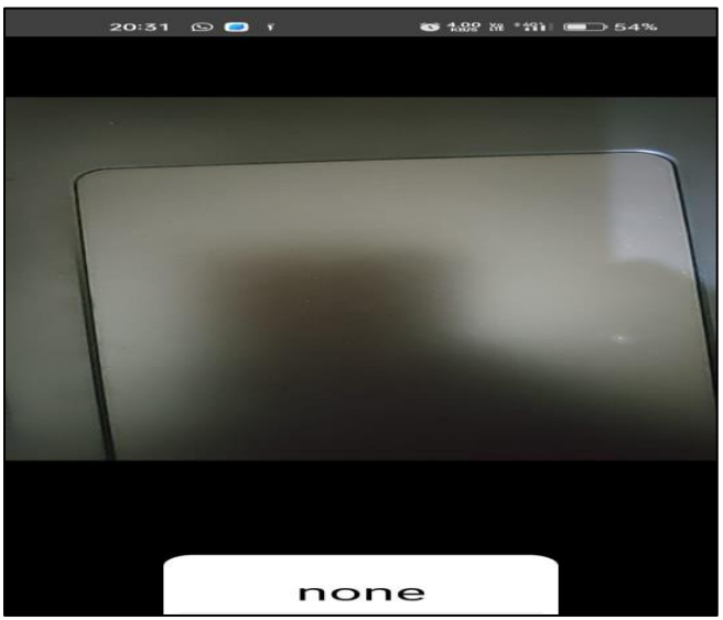
Fig 3 Currency Detection