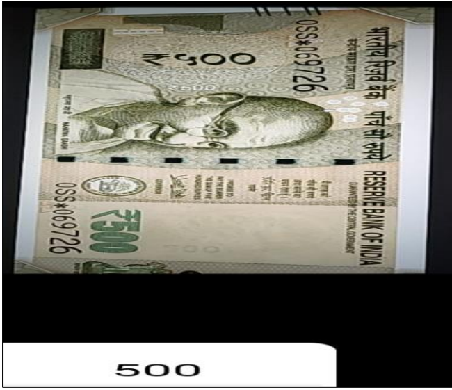
Fig 4 Currency Detection