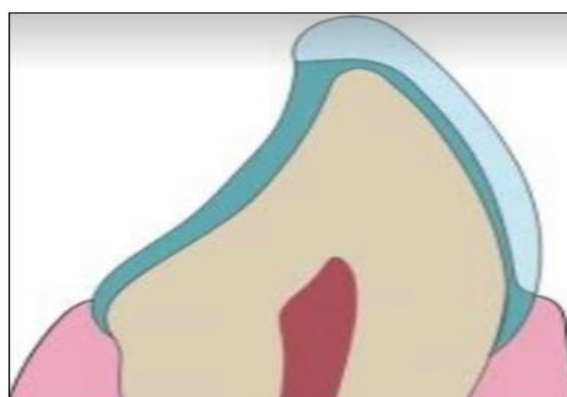
Fig 2 butt joint preparation