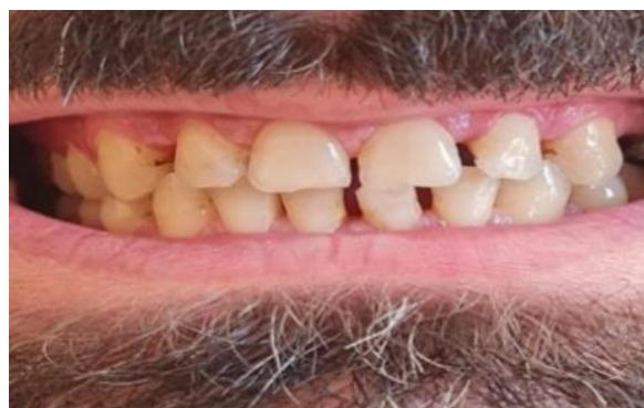
Fig 1 Intra-Oral Frontal View

34-year-old patient attended at the department of prosthodontics of dental clinic. He was complaining about the polydiastema. He declined orthodontic therapy, therefore veneers were the procedure.