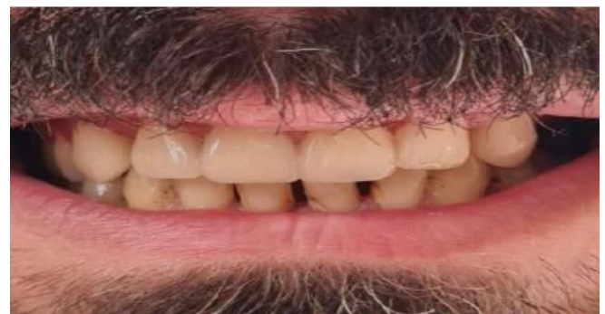
Fig 7 Veneers installed, final smile