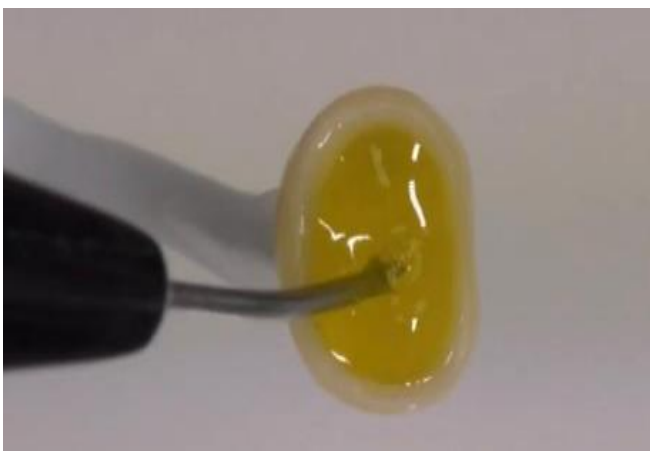
Fig 4 Etching