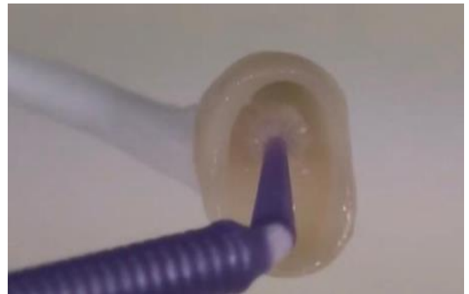
Fig 6 Silane then Drying with air x 1 min