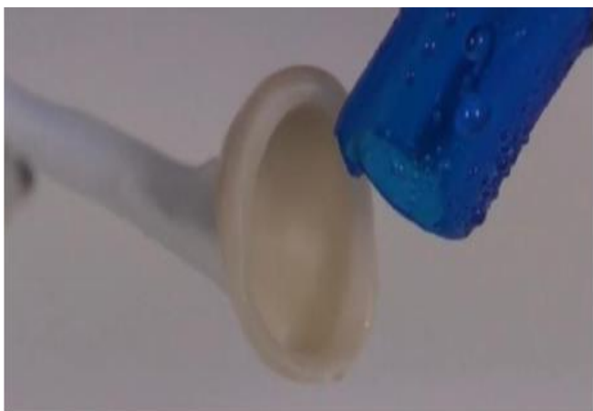
Fig 5 Ultrasound