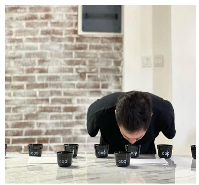
Fig 9 The Process of Cupping

In addition to brewing methods, cupping plays a crucial role in evaluating the quality of Arabica Semendo coffee. Cupping is a testing and evaluation method that encompasses aspects such as taste, aroma, acidity levels, body, and coffee cleanliness. This process uses hot water at a high temperature, reaching 95 degrees Celsius, allowing for a meticulous analysis of the coffee's flavor characteristics.