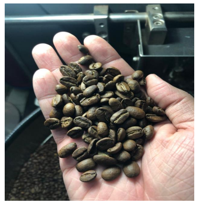
Fig 3 The Result of Coffee Processed using the Washed Method after Roasing

The washed post-harvest process ensures that Arabica Semendo coffee is meticulously processed to create its distinctive flavor profile, often described as having sweet fruity notes, balanced acidity, and a rich, deep body. The excellence of this process, combined with the ideal geographical environment, has made Arabica Semendo coffee one of the finest coffees produced in Indonesia.