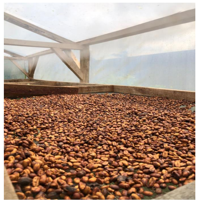
Fig 4 The Process of Honey Process Method

Arabica coffee from Semendo is known for its various processing methods that result in unique flavor characteristics. One of the well-known methods used is the honey process, which creates coffee with exceptionally sweet flavor characteristics.