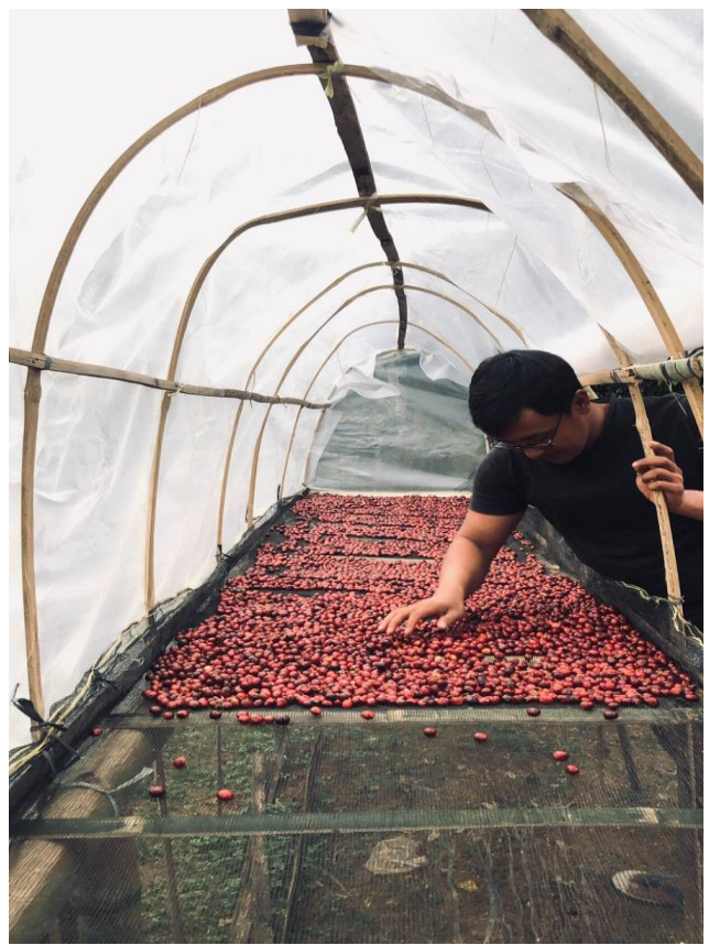
Fig 1 Process of the Natural Method

The natural processing method in the production of Semendo Arabica coffee is one of the distinctive features that sets this coffee variety apart from others. In this method, Arabica coffee beans are processed by allowing them to dry inside their fruit's skin, without prior pulping. The drying process is carried out either under direct sunlight or in special drying machines. The outcome of the natural method is coffee with a unique and distinct flavor profile.