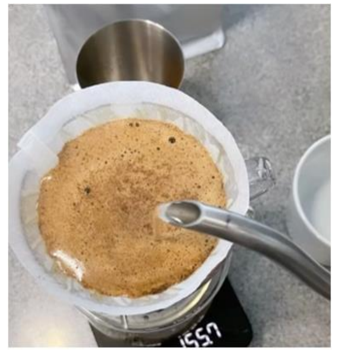
Fig 8 The Process of Manual Brewing

Conversely, the manual brew brewing method provides a lighter experience. The solid content in Semendo coffee brewed with the manual brew method is typically lower, resulting in a lighter and balanced cup of coffee. The sweetness and floral aroma are still present, but with a gentler intensity. Slightly lower acidity makes this coffee taste smoother, suitable for those who appreciate coffee with lighter flavor characteristics.