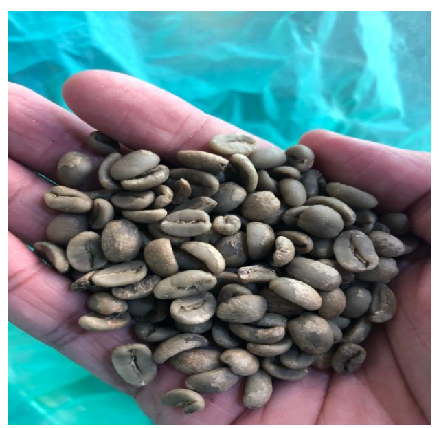
Fig 2 The Results of the Washed Method

Semendo Arabica coffee, grown in the Semendo region of South Sumatra, Indonesia, possesses unique characteristics that inspire a meticulous post-harvest process. The postharvest process of the washed method for Semendo Arabica coffee involves a series of steps that influence its final flavor.