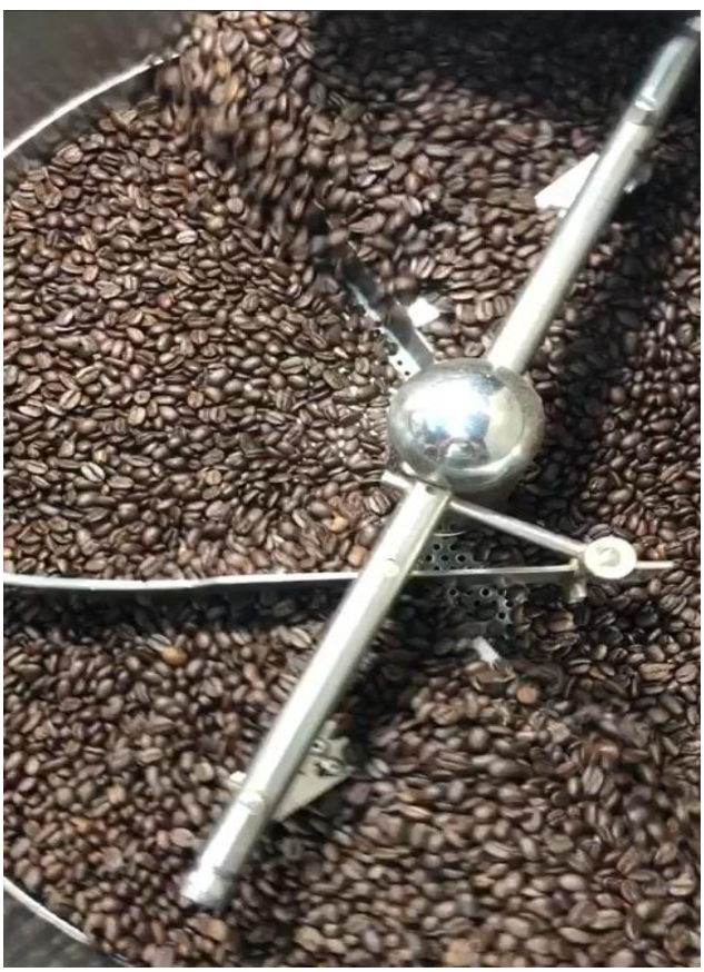
Fig 6 Roasting Process of Arabica Semendo Coffee

It's important to note that roasters can fine-tune their roasting profiles to achieve specific flavor goals. The choice of roast level largely depends on the preferences of both the roaster and the consumers. Lighter roasts highlight the unique terroir of the Semendo region, while darker roasts create a more robust and intense flavor. Ultimately, the art of roasting lies in finding the perfect balance to accentuate the desirable qualities of Semendo Arabica coffee beans, making it a truly unique and sought-after coffee variety.