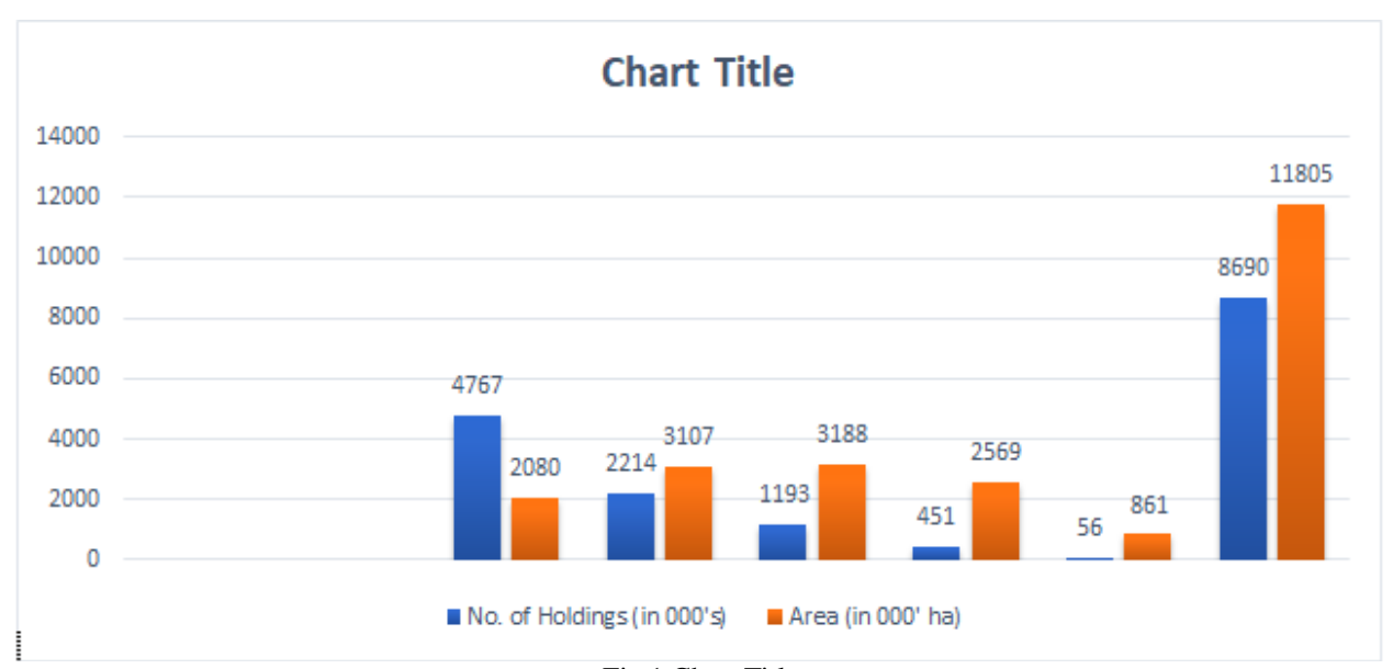
Fig 1 Chart Title