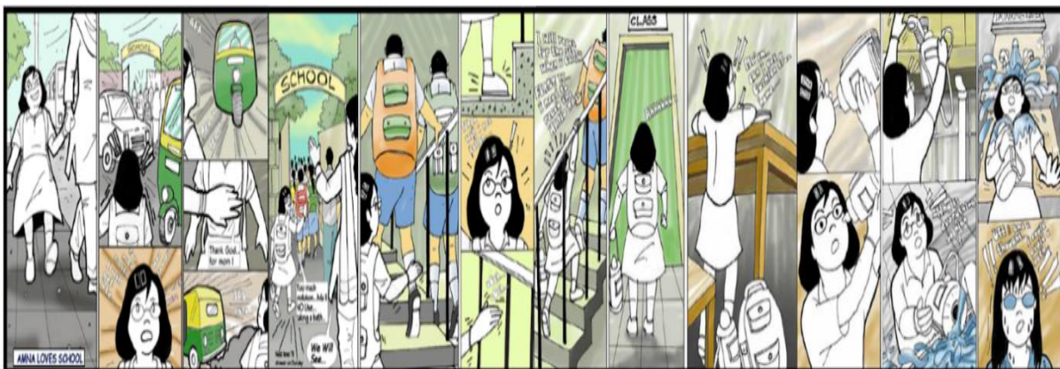
Fig. 3: Child in the School

friendly. Generally, they face issues such as traffic congestion just outside the school, all necessary equipment is designed with the consideration of adults. Here the younger child asked, "If the school is in our area, why is it not as per our needs?"