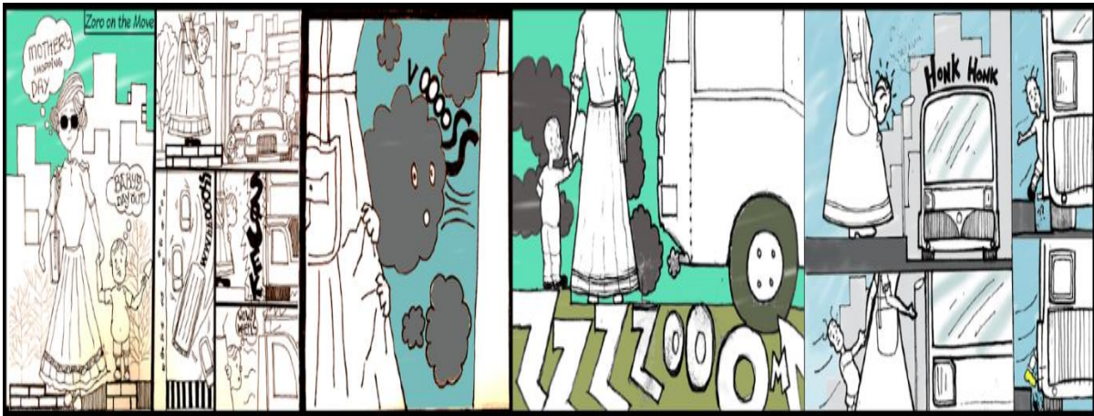
Fig. 1: Child Moving in the Neighbourhood