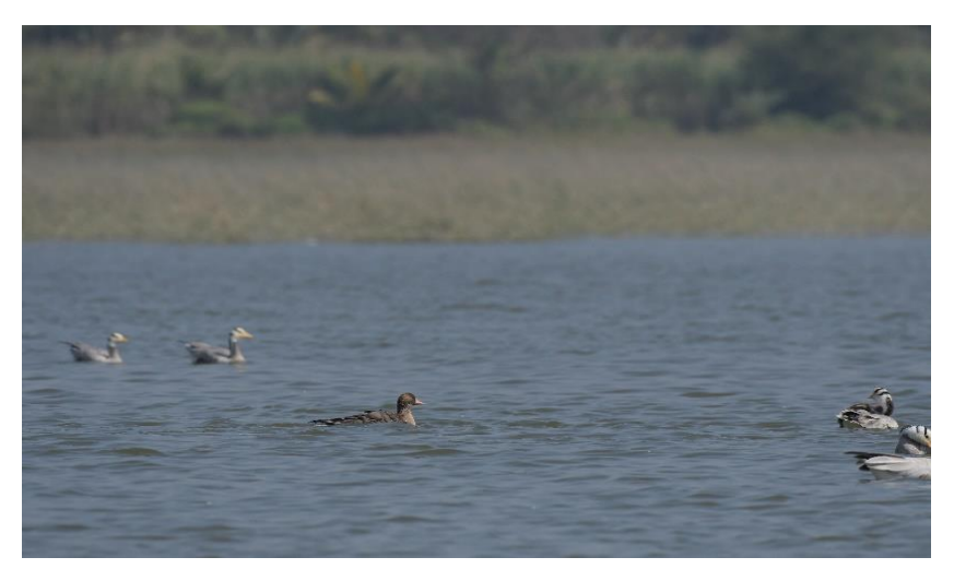
Fig. 3: Dispersal of Flock of Bar-Headed Goose (Anser indicus) in the Hadinaru lake

After photographing the birds, with a speculation of it being a rare white fronted goose we went back to (Grimmett et al., 2016) to compare the species characteristics (Fig. 3), and indeed it was the Greater White-fronted Goose Anser albifrons . The lone A.albifrons was seen foraging and playing with Bar-headed goose. The bird was again and seen and photographed 23<sup>rd</sup> Feb 2023, with word of mouth the bird was seen and photographed in the same lake premises by several other birdwatchers and nature enthusiasts (Table 1). Adults are mostly brown with white feathering around the base of a pinkish-orange bill. Black barring marks the belly and the undertail is white. In flight a white "U" at the base of the tail is visible. At rest, a thin white line stretches across their sides.