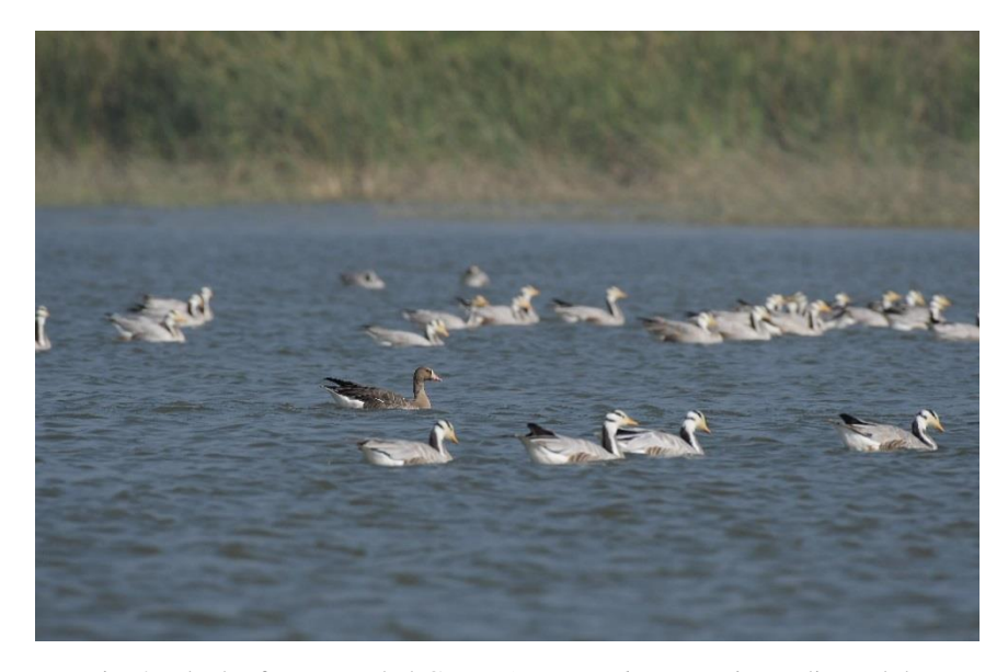
Fig. 2: Flock of Bar-Headed Goose (Anser indicus) in the Hadinaru lake