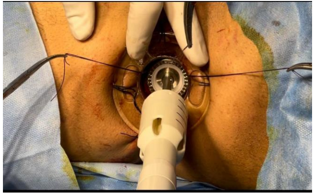
Fig 3 Introduction of MIPH Stapler

Subsequently, a circular stapler is introduced trans anally . Fig : (3) The anvil of the device is positioned proximal to the purse string suture, and the suture is tied down on to the anvil.