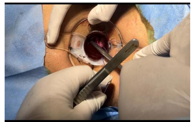
Fig 2 Application of Purse String Suture 4cm Above Dentate Line.

Subsequently, a circular stapler is introduced trans anally . Fig : (3) The anvil of the device is positioned proximal to the purse string suture, and the suture is tied down on to the anvil.