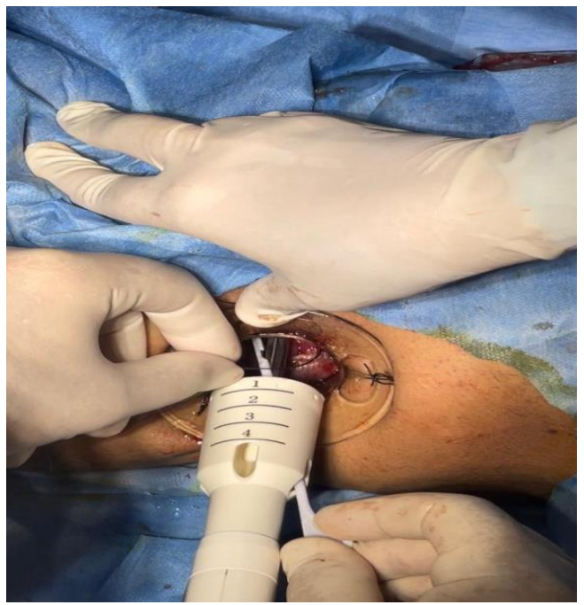
Fig 4 Feeding of sututres.