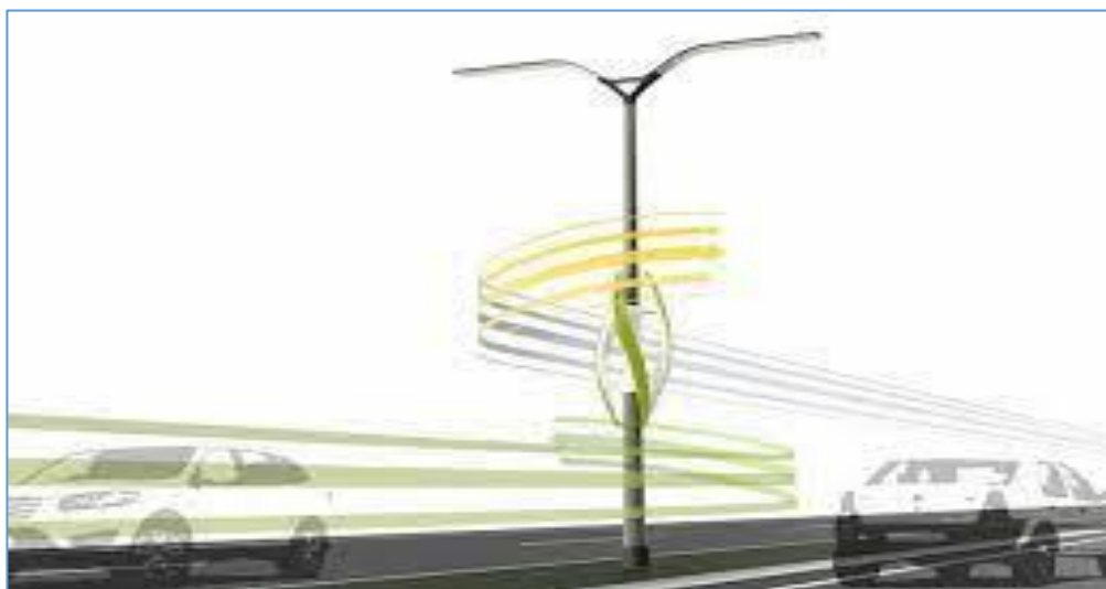
Fig. 3: Turbine On Street Light