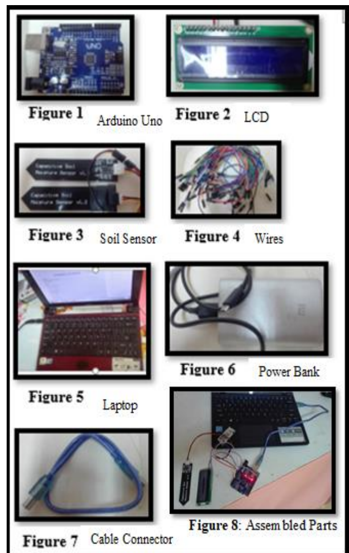
Fig A. List of Materials Needed: figure 1 arduino uno core board, figure 2 LCD (liquefied crystal display) monitor & GSM SIM800C, figure 3 capacitive soil moisture sensor, figure 4 female and male wires, figure 5 laptop, figure 7 cable connectors, and figure 8 assemble parts.

This study composed of three phases: Phase I – Gathering and Assemble of Prototype Gadget with Electricity Producing Stationary Bicycle (EPSB), Phase II – Preliminary Testing of the Assembled Prototype Gadget with EPSB, and Phase III – Data Collection and Analysis.