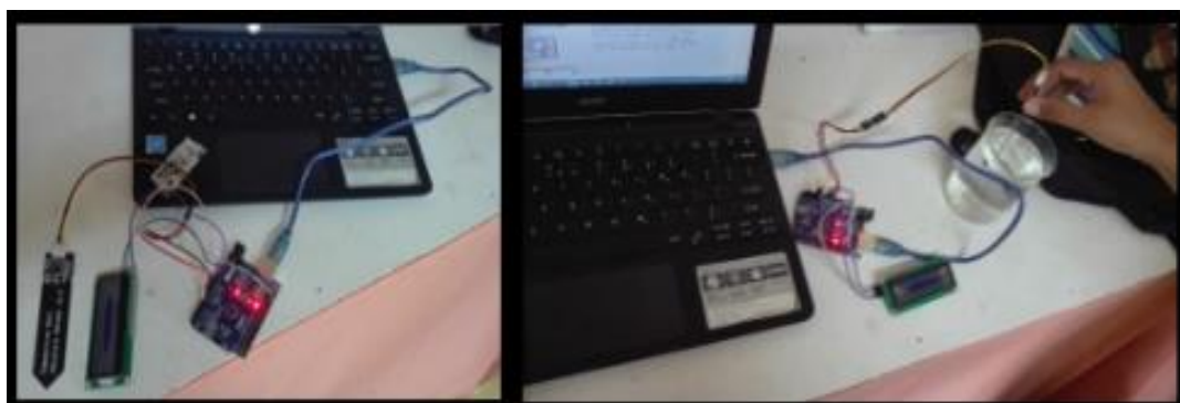
Fig D: Testing and Programming the Sensors (Soil Moisture Sensors, LCD with Arduino Uno Core Board).

texting the athlete (Refer to Figure 12) under the electricity-producing stationary bicycle or EPSB including item number 1 to 7 (Refer to figure 11). The researchers do perform a series and multiple testing in order to achieved the suited codes for running the system under capacitive soil moisture sensor v1.2, SIM800CGSM, LCD with ITEM number 1 to 7 in figure 11 and with the consultancy of the electrical engineer in our school, our information technology teacher before running to actual testing with athletes.