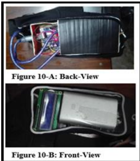
Fig B. figure 10-A back view, figure 10-b front view of VRM-energy accumulating EPSB.