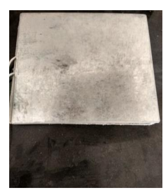
Fig. 3 Heater