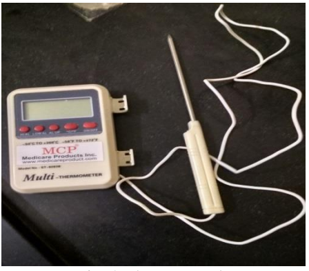
Fig. 2 Thermocouple