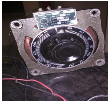
Fig. 4 Dimmer