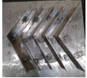
Fig. 5 V-Shape Fin

The fins are fabricated from a 3mm wide sheet of aluminium alloy 1100. All cooling fin patterns have the same base plate dimensions (i.e. 200 mm 200 mm). The 200mm40mm Al-plate is bent from the centre at an angle of 120^{\circ} , and the resulting V-fin pattern's five fins are evenly spaced. The whole assembly is placed on heater of 200 W heater and dimmer is used for change in voltage and so corresponding value of current also vary and which can be measured by digital ammeter; 6" fan is to supply air on experimental set up.