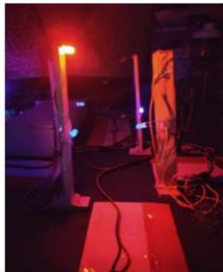
Figure 4.3: Orange light when VIP passes