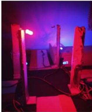
Figure 4.1: Red stop light