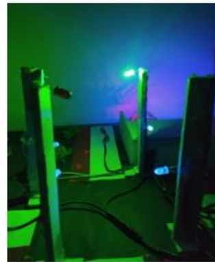
Figure 4.2: Green Light for Go