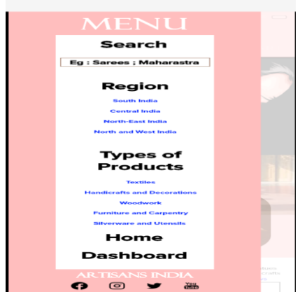
Fig. 7: Search Bar helping customers navigate