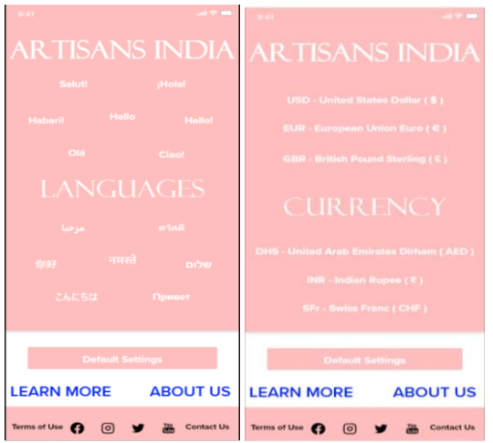
Fig. 4: & Fig. 5: Showcasing the language and currency choices being implemented to allow for a wider array for customers