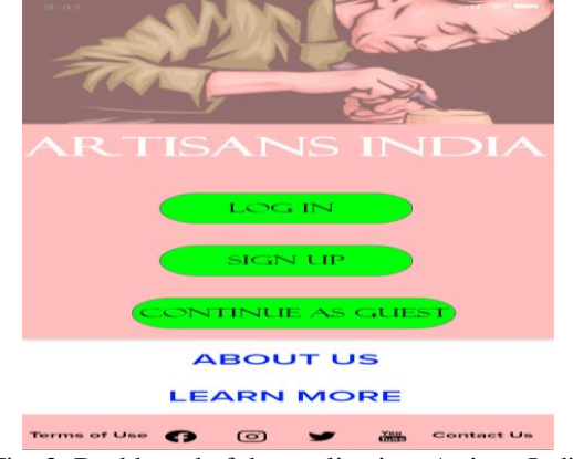
Fig. 3: Dashboard of the application, ArtisansIndia

The first beta version of the user interface has been tested with around 15-20 people with positive comments and valuable feedback. The estimated growth was based upon the data of previous endeavors, feedback and comments of consumers as well as mathematical estimations. The application is due to be available on the App Store and the Play Store for download as well as on the internet on a web version. The proposed application page is shown in Figures 3 to 7.