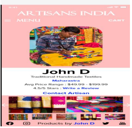
Fig. 6: Example of an Artisan's Page