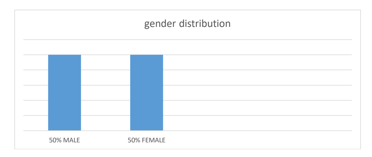
Table 1: Distribution of patients based on gender [p>0.05, no significant difference]