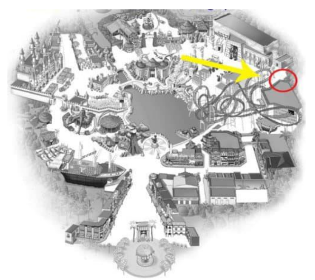
Fig 1. Location of the prayer room at Universal Studio

Universal studio visitors can exit and re-enter the studio in the same day with the stamp/ticket. This tourist attraction can be considered as Muslim-friendly, because it provides prayers' room for Muslim.