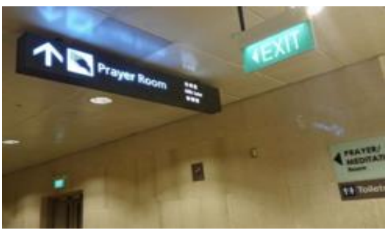
Fig 9. Musholla sign in Changi Airport