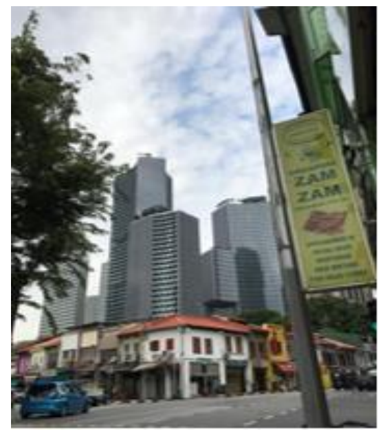
Fig 5. Zamzam Restaurant

Judging from Relaxing and exciting or something fun, it can be described through various Muslim-friendly tourist destinations that provide facilities for worship and halal culinary. Every tourist destination has facilities for worship and halal culinary. Visiting Singapore feel no big difference for Muslim tourists. Because Singaporean are disciplined, friendly, and easy to get the information they need. Muslims who wear the hijab are also allowed to enjoy destinations in Singapore. There are information signs for mosques, prayer rooms, halal cuisine, road directions, and directions. This makes it easier for tourists to do many kinds of tourist activities in Singapore. The following are the results of the research obtained regarding directions, mosques, and prayer rooms provided in public facilities.