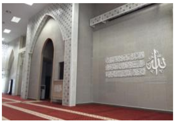
Fig 8. Interior of masjid Al Falah