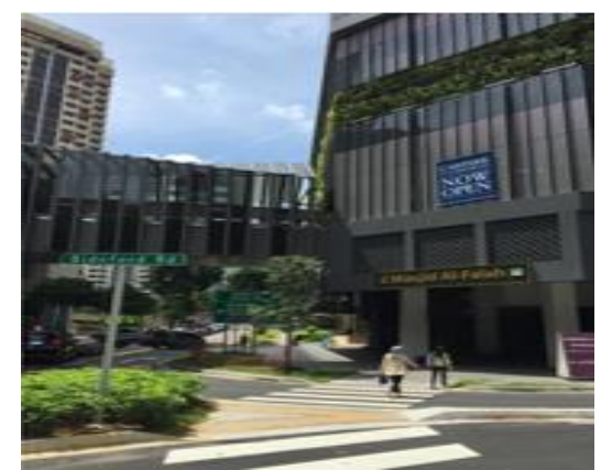
Fig 7. Masjid Al-Falah Personal Documentation