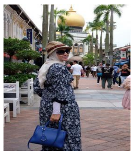
Fig 2. Sultan Mosque Personal Documentation

many Muslim tourists choose this area to stay and enjoy local culinary.