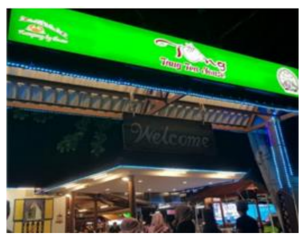
Fig 3. Halal culnar in Jalan Kayu Personal Documentation

Based on the research results, divided into 2 categories, namely 1) Pleasant and arousing , and 2) Relaxing and exciting . Based on Pleasant and arousing or a sense of security, traveling in Singapore feels safe and comfortable. Enjoying culinary at night can also be done safely and comfortably.