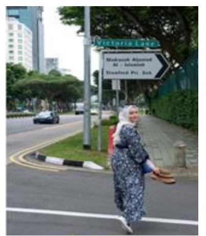
Fig 6. Street sign to Madrasah Islamiah