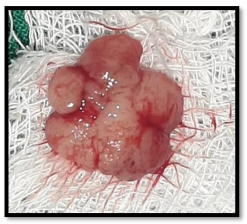
Fig. 6: Excised lesion

Histopathology showed stratified squamous parakeratinized epithelium which is discontinuous. Some of the rete ridges are elongated. The underlying connective tissue stroma shows presence of abundant chronic inflammatory cell infiltrate, histocytes, budding capillaries, fibroblasts and collagen fibres. (Fig 7) Based on a histological report a final diagnosis of pyogenic granuloma was given.