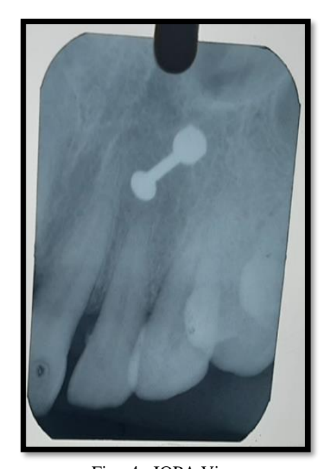
Fig. 4: IOPA View

Radiographically no bony changes or abnormalities was noted in the region of growth. Only horizontal bone loss was seen. (Fig 4) Based on clinical and radiographic data, the growth was diagnosed as pyogenic granuloma, and an excisional biopsy was planned.