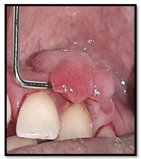
Fig. 3: Pedunculated Growth

Radiographically no bony changes or abnormalities was noted in the region of growth. Only horizontal bone loss was seen. (Fig 4) Based on clinical and radiographic data, the growth was diagnosed as pyogenic granuloma, and an excisional biopsy was planned.