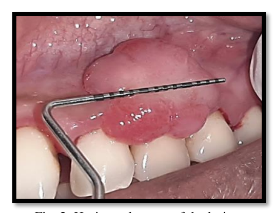
Fig. 2: Horizontal extent of the lesion