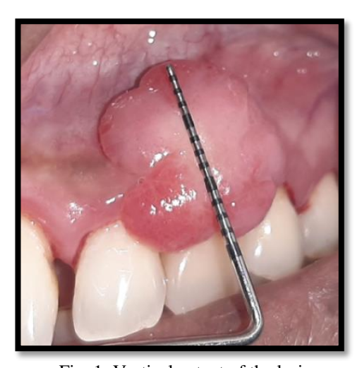
Fig. 1: Vertical extent of the lesion

Clinical examination revealed a localized gingival swelling of 15 X 14 mm size present in relation to 22,23,24. (Fig 1, Fig 2) It was a well-defined pedunculated, lobular growth which was firm in consistency and vascular. (Fig 3)