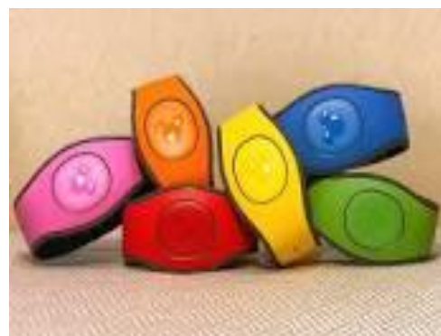
Fig. 3: Magic Band from Disney

what’s available in Disneyland. They will wear it while in the school providing a sense of security and consistent experience.