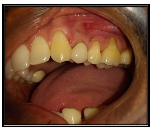
Figure 1: Class I recession irt 24,25,26