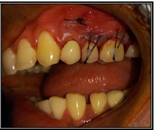
Figure 1.5: Vicryl sutures placed