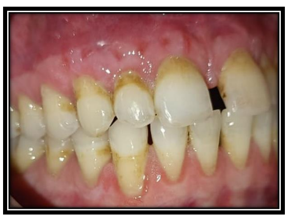
Figure 2.2: Case 2 re-evaluation