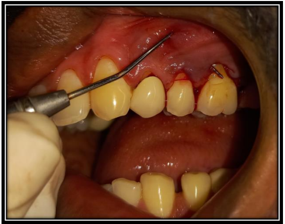
Figure 1.2: VISTA approach