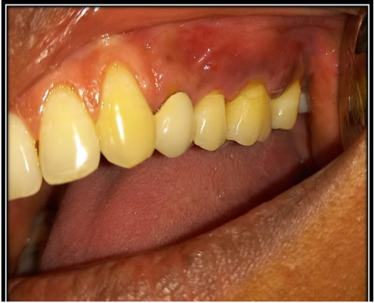
Figure 1.6: 3-month evaluation