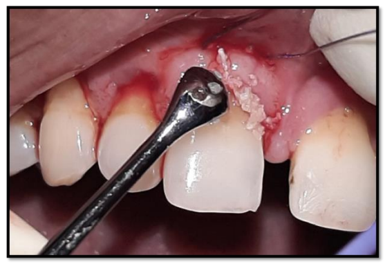
Figure 2.1: Placing of sticky bone