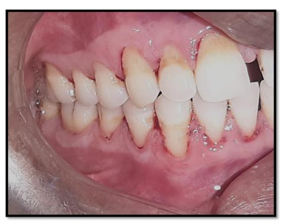
Figure 2: Pre-op case 2