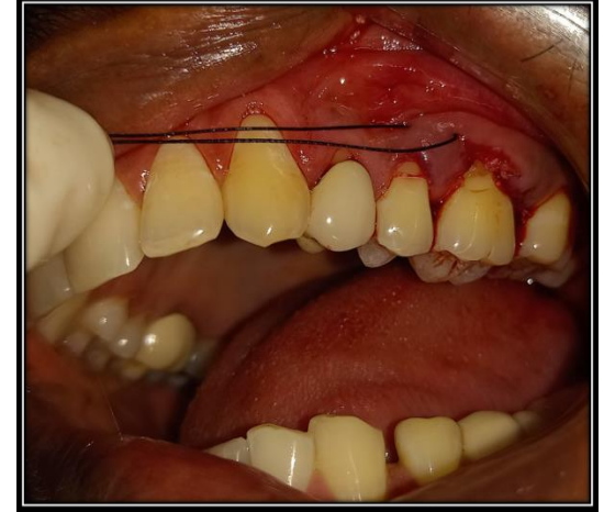
Figure 1.4: Sticky bone and collagen membrane placed