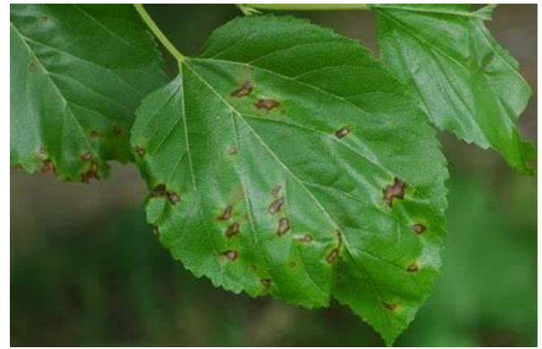
Fig 2: Leaf spot

At the beginning of the disease there will be small light brown irregular spots appear on mulberry leaf surface. Later, these spots enlarge and join together leaving with characteristic 'shot hole' and yellow patches around the brownish spot and wither off.