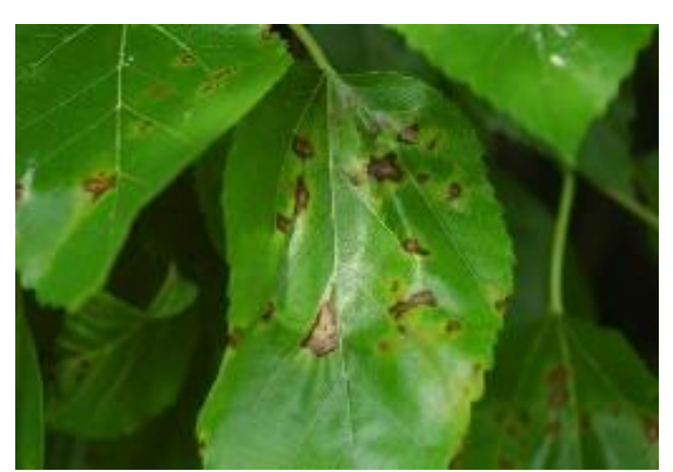
Fig 4: Leaf curl