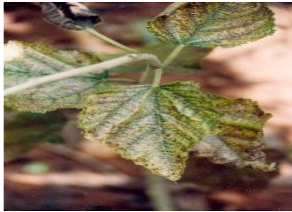
Fig 3: Leaf rust

At the rust disease initial stage, the symptoms is a circular pin head sized light brown spots and becomes darkish brown spots as disease advances. The leaf loss is up to 5 %. Rust severity significantly increased with increasing shoot age, irrespective of pruning time.