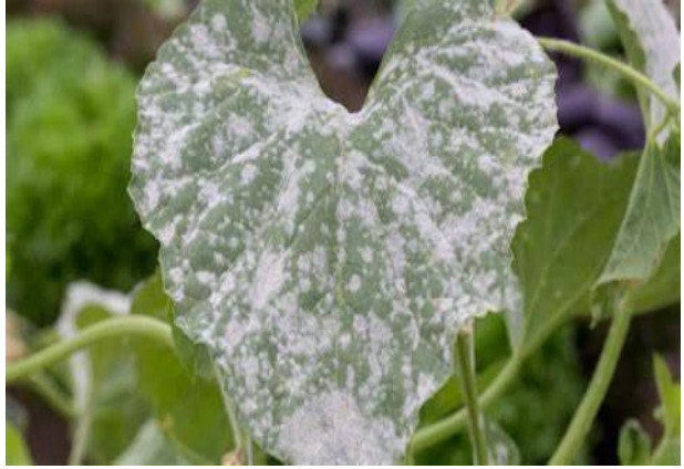
Fig 1: Leaf spot

Powdery Mildew Disease of mulberry is caused by fungal Pathogen, Phyllactinia corylea . The major symptom of this disease is an appearance of white powdery patches on the lower surface of the leaves. When the disease is severe, the white powdery patches turn in to brownish-black; the leaves become yellow, coarse and lose their nutritive value. The severely infected leaves will be become powder brittle even after gently crumple by hand.