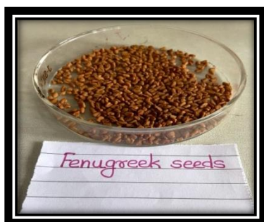
Fig. 3: Fenugreek Seeds