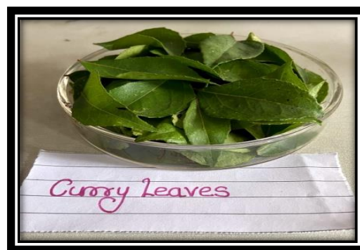
Fig. 1: Curry Leaves