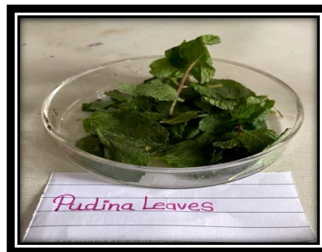
Fig. 5: Pudina Leaves