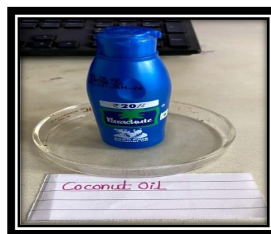
Fig. 6: Coconut Oil