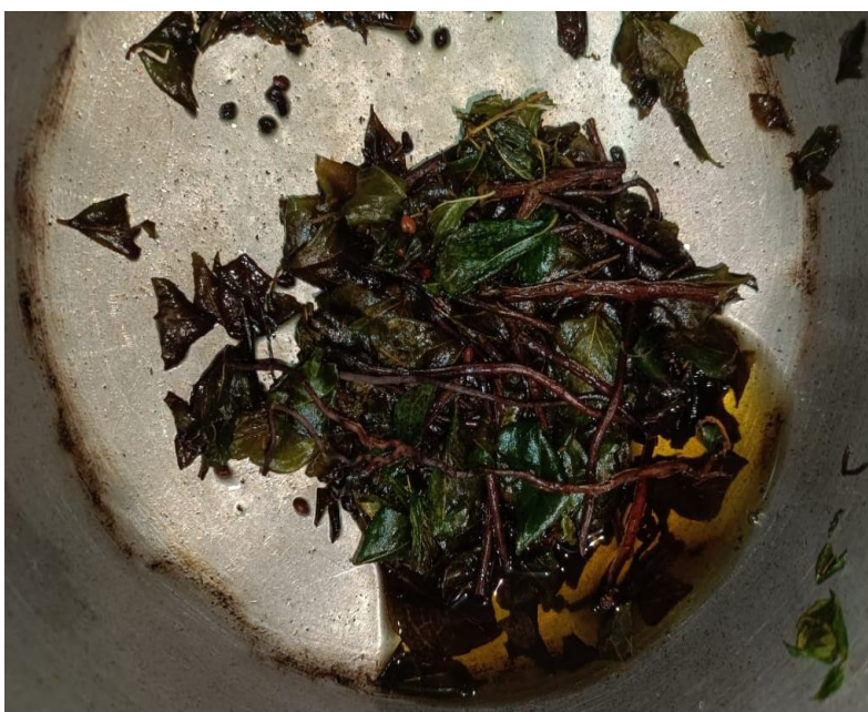
Fig. 8: Preparation of the formulation