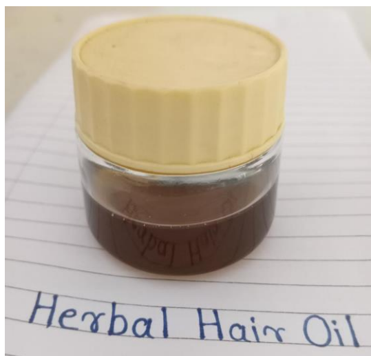
Fig. 7: Herbal Hair Oil