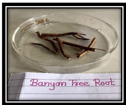
Fig. 2: Banyan tree roots: