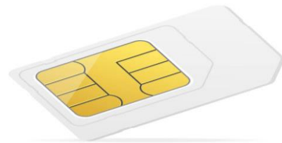
Fig. 2 : SIM (Subscriber Identity Module)

SIM stands for Subscriber Identity Module. Initially, it was designed for mobile phone networking only (like calling and messaging, mostly for calling). But in this time, it is used for multipurpose. In GSM module, a slot is fixed for SIM to insert in. These days the dimension of SIM cards reduced radically and its functionality is increased. So dual SIM handsets are also available in market in which we can use two different SIM cards. SIM can also be used as storage for phone contacts, messages, roaming information across different networks, voice call records and many more data services. Presently mobile payments are done using mobile phones that can't be possible without SIM that's make it more popular. There is no issue with SIM cards when it is replaced from one mobile phone to another. It will perform the same task that it was doing in previous mobile phone. So, it is easy to change mobile phone or handset using the same mobile number.