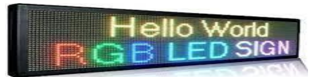
Fig. 3: LED Display

Light Emitting Diode, in short LED is a semiconductor device based on the Electric Luminescence principle. It has no moving parts, only made for solid materials. So often designed into transparent body. It is commercially used device for screening the display board. When LED is supplied from its two semiconductor coated terminals then it starts emitting light without heating that reduces the problem of heating in electronic components. LED based display consist of a number of LEDs connected closely to each other. By changing the value of each LED's brightness, a image is form that is the our required output displayed on display board. The image form has brilliance light intensity. This type of display is more efficient and less power consuming. For designing a LED display board following factors should be already known such as the display type, colour, size, brightness, and the number of LED required for that particular display board.