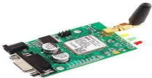
Fig. 1 : GSM Modem

GSM is nothing but a Global System for Mobile Communications chip that works as a medium between mobile phone (transmitter) and display board (receiver). It was flourished by the European Telecommunications Standards Institute (ETSI). It is the main part of the whole setup. The GSM modem is linked with power supply circuitry and communication interface (RS-232) with programmable devices. It can also be linked with dedicated modem devices like input-output serial ports, USB (Universal Serial Bus), Bluetooth or mobile phone that make it more compatible to use. Each GSM module is linked with an identical mobile phone. It is also implemented for voice and data services operate at the 850MHz, 900MHz, 1800MHz, and 1900MHz frequency bands. In case of interference between two information, GSM modem uses time division multiple access (TDMA) technique that gives it different time slot for each user at same frequency to send their information. GSM modem has very wide applications in many fields such as in transaction terminals, supply chain management, security applications, weather stations, and GPRS mode remote data logging.