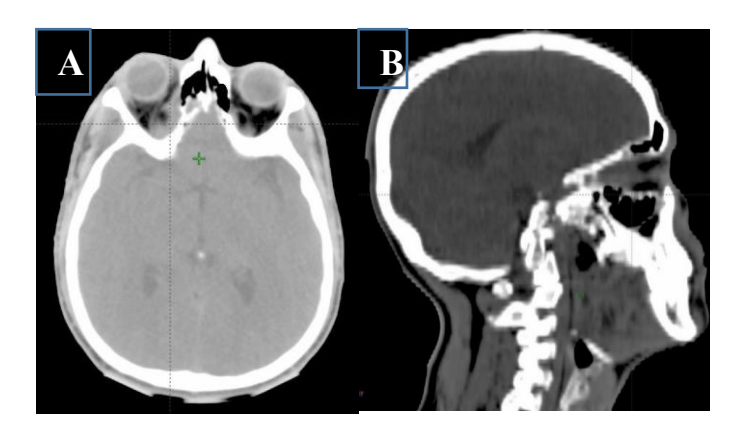
Figure 2: axial (A) and Sagittal section (B): Sharp regression of the right facial process and lymphadenopathy