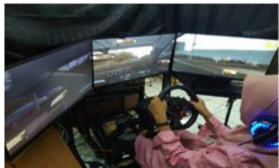
Fig 2. Driving Simulation

This study designed by using an experimental design, where the subjects were divided into two groups, namely the experimental group and the control group. The experimental group got a density level of 75% and the control group got a density of 50% as when driving normally.