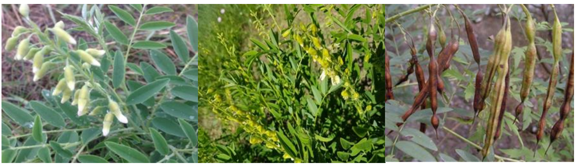
Figure 2. Growing in the Botanical Garden Sophora flavescens Solander.

in Gurvanzagal soum, Dornod province, were grown by M. Tsolmon, a researcher at the Institute of Biology of the Mongolian Academy of Sciences. The plant was planted in ex situ conditions in September 2014 in the medicinal plant area of the Botanical Garden, an experimental research area of the introduction laboratory in the plant gene pool of the Botanical Garden of the Mongolian Academy of Sciences. The plant survival rate was 72 percent, and 10 individuals grown in ex situ conditions began to bloom in the third year, in 2017, so they were selected based on research materials.