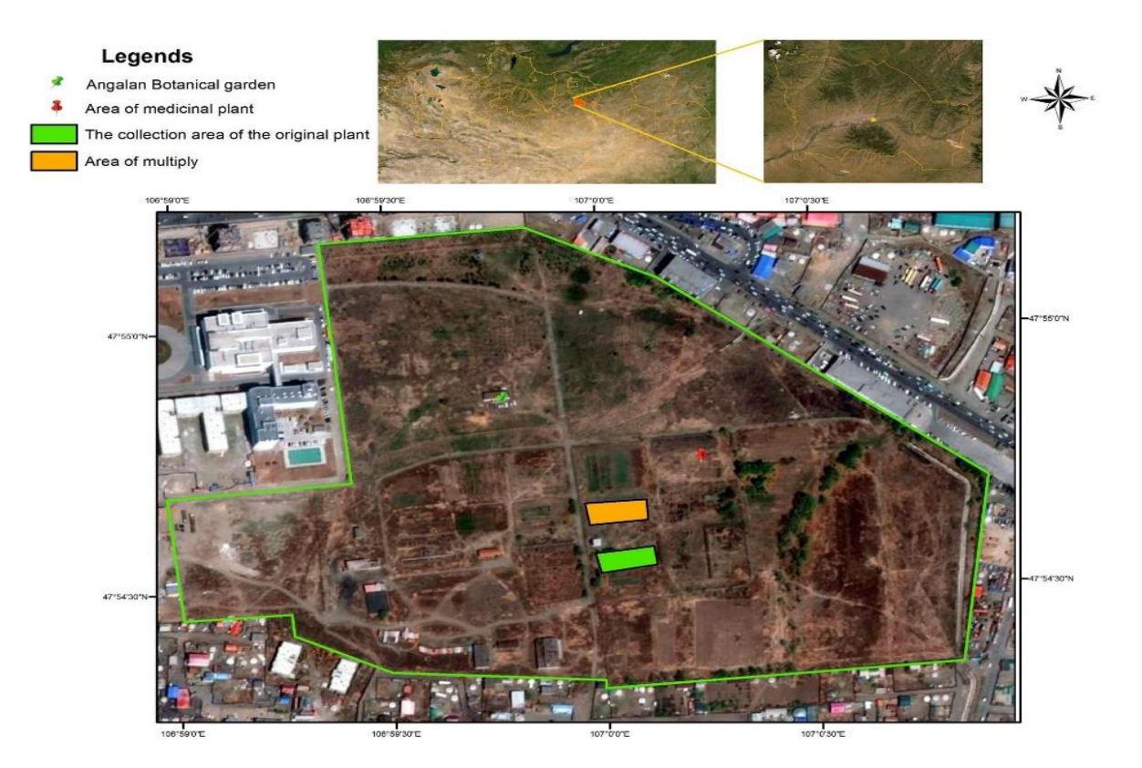
Figure 1.General area of the Botanical Garden