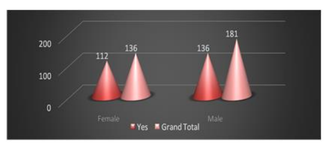
Fig 2:- Chart answering the question 'Do you light Diyas during Diwali' for both the genders

3. Majority of people prefer to buy Diyas from roadside stands. This tells us that they are considerate towards the poor craftsmen. We can also infer from the table below that more men prefer to buy from big retail outlets, as compared to females.