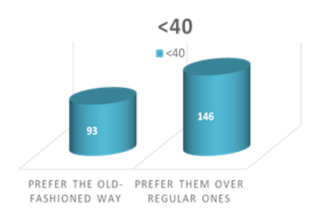
Fig 5(a):- Graphical representation of the data obtained for environmental preferences for the age group '<40'

5. We interpreted most of the young generation tends to buy more of eco-friendly Diyas over regular Diyas, which shows there care and awareness regarding environment.