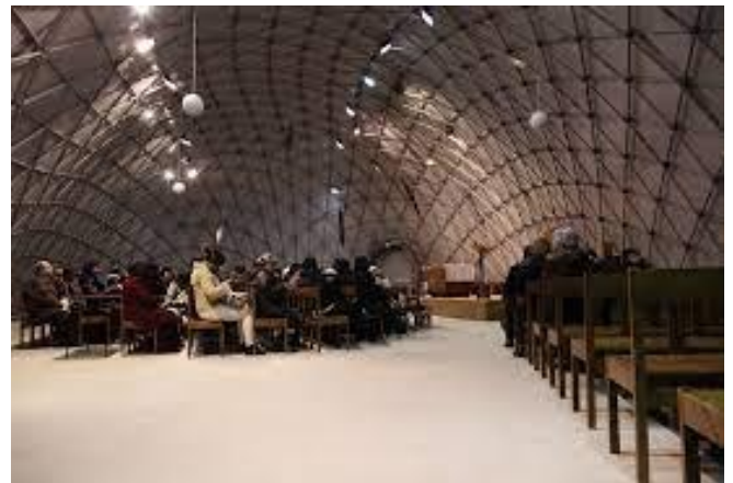
Fig 4. Ephemeral Cathedral, Paris

Although they are referred to as reinforced concrete shells, they are actually a system of concrete ribs that support a total of 2,194 precast concrete roof panels that are clad with over 1 million tiles. The tile surface is extremely detailed, with two types of tiles - one glossy white and the other matte cream. One of the earliest applications of computer analysis was with the design of the shells. Throughout the site, large sections were utilised from factories for these precast prefabricated components. The building's structure is of reinforced concrete, and its facades are polarized glass with steel frames. The shells are surrounded by white and cream mate tiles created in Sweden, which appear white from a distance. Pink granite from Tarana and plywood from New South Wales are the most common interior materials[1].