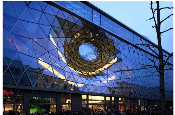
Fig 1. Myzeil façade Frankfurt