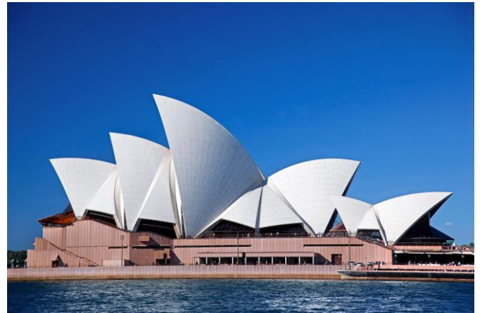
Fig 3:- Sydney Opera House, Australia

Although they are referred to as reinforced concrete shells, they are actually a system of concrete ribs that support a total of 2,194 precast concrete roof panels that are clad with over 1 million tiles. The tile surface is extremely detailed, with two types of tiles - one glossy white and the other matte cream. One of the earliest applications of computer analysis was with the design of the shells. Throughout the site, large sections were utilised from factories for these precast prefabricated components. The building's structure is of reinforced concrete, and its facades are polarized glass with steel frames. The shells are surrounded by white and cream mate tiles created in Sweden, which appear white from a distance. Pink granite from Tarana and plywood from New South Wales are the most common interior materials[1].