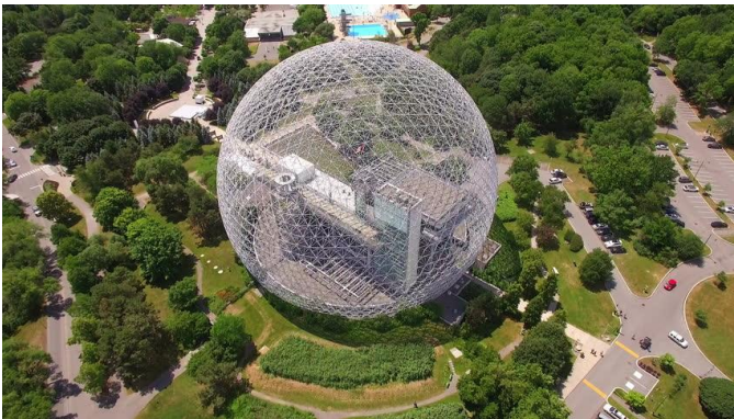
Fig 5. Montreal Biosphère

For almost twenty years, Ar. Buckminster Fuller had been perfecting his designs. A diameter of seventy-six meters, the expansive sphere reaches an astounding 62 meters into the sky and thoroughly dominates the island on which it is located. The volume contained within it is so spacious that it comfortably fits a seven-story exhibition building featuring the various programmatic elements of the exhibit.