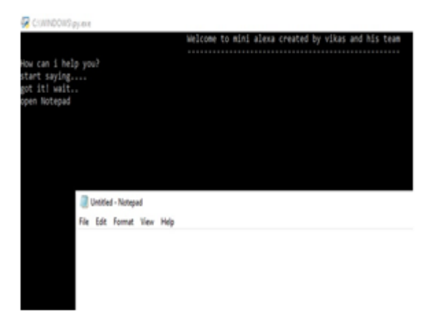
Fig. 3 Writing mode of an input