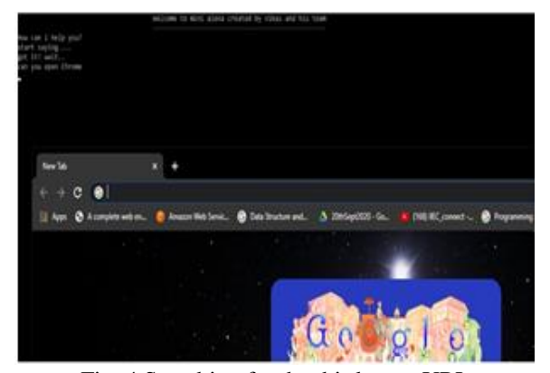
Fig. 4 Searching for the third party URL