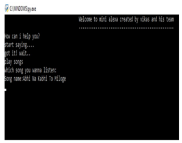
Fig. 2 Welcome mode

All IVAs change over time. While all four IVAs were able to answer approximately 17.35% of the daily questionnaire, only the Google Assistant was found to be very effective in answering 59.80% of the question. Contrary to previous estimates, Siri has brought a little bit of injury by responding to only 46%. While Cortana could only answer one-third of the question. Alexa lost the race badly by turning only 7.91%. That, of course, was a terrible defeat. According to our study, IVAs have a very low memory rate, with only 26% of daily life clients. Alexa, Google Assistant, Siri, and Cortana are in good progress over the years. It is very likely that one day they will meet our appointment.