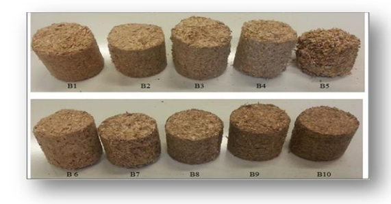
Figure 5 Sample selected briquettes

The selection of sample for this study was based on random sampling techniques. Twenty biomass briquettes were essentially developed from which ten samples were randomly picked for the study.