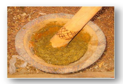
Figure 3 Materials broken down with a grinder

In order to produce briquettes from biological wastes, bio-material are required to be grinded and pounded to provide a arbitrary allotment of fibers, ahead of being reformed into briquettes. Biological wastes are required to be chopped, partly decomposed, soaked and pulped. This is just to form a charge of wet material for the mould, Materials particularly bagasses, Fruits peels and saw dust collected were sundried to reduce moisture content to approximately 12% which is within the tolerable operating limit for briquetting [16]<sup>16</sup>. Grinder was used to reduce the materials to smaller sizes and paper was manually chopped in to pieces.