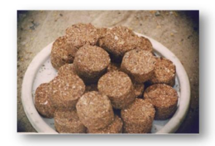
Figure 4 produced briquettes

Biomass briquettes were developed by solidifying the mash in the mould using locally developed manual hand press briquetting machine. Twenty biomass briquettes were essentially developed in the Laboratory of the college. An illustrative view of the briquettes produced is presented below.