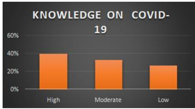
Figure 1: Knowledge On Covid -19

Figure one showed that majority (40%) of the samples had a high level of data, 33.3% of them had a moderate level of data and 26.7% of them had an occasional level of data on COVID - 19.