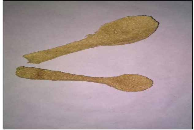
Fig 2- Biodegradable Cutlery (spoons) made from Moringa pod husk powder