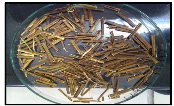
Fig 1 Dried Moringa pod husk

Moringa (Drumstick) pods collected were fully matured and healthy from trees in my residential area. The pods were washed with water and dried. The dried pods were deseeded and pulp was removed using knife. The remaining pod husk was used for study. The pod husk was chopped into pieces of equal length and dried in hot air oven for 24 hours. The dried pods husks were ground in a grinder, and thepowder obtained was used for the study.