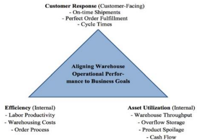
Fig. 1. Dependence between warehousing goals and business goal.

Warehousing has become increasingly important time to set warehouse goals in accordance with broad company strategies. Traditionally, warehousing goals have focused on being productive, fast, cheap and accurate, but now it is time to complement these goals with value-oriented goals. He emphasized the focus among three types of operational performance objectives: efficiency, asset utilization, and customer response. Figure 1 represents this triangle of warehousing purposes.