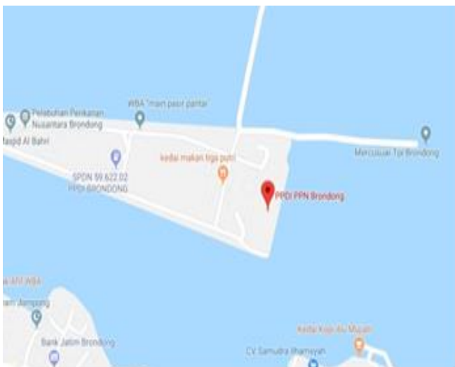
Fig. 2. PPDI PPN Brondong as the First Point of Reference in Determining the Location of Supporting Facilities.

Gravity location model is used as a basic way to determine the location of supporting facilities, while the steps required are determining the location as a basis for reference points as input distance. In this case the first reference point chosen is PPDI PPN Brondong. This selection was made because PPDI Brondong is fish auction center as the largest fish auction site on the north coast of East Java and based on the results of inter-port connectivity studies found that the PPDI Brondong has a central role as the start of the capture fisheries supply channel, especially on the North East Coast. The Map of PPDI Brondong PPN can be seen in the following figure 2 below :