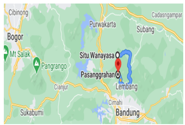
Fig 3. The location of Situ Wanayasa leads to the Kampung Tajur Tourism Village in Pasanggarahan Village

Wanayasa are various water games such as go-fishing. There is no public transportation that can be used. However, we can rent a small public transportation (minibus) at a cost of IDR 50,000 per person.