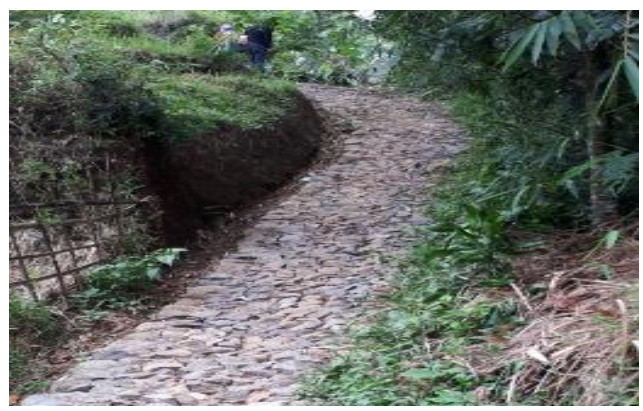
Fig.11 Outdoor activity: Exercise going up-down the road So far there are no indoor leisure activities in Kampung Tajur Tourism Village.

Outdoor activities in the Kampung Tajur Tourism Village are rice planting activities, take a leisurely walk along the village lane, take pictures of the pepper or the river, the rice fields. Figure 11 displays the outdoor activities that can be carried out in Kampung Tajur Tourism Village.