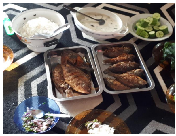
Fig.6 Lunch and Dinner menu (served all at once at lunch)

Based on observations and interviews with informants on the availability of food and beverages, although there are not many food traders, but where food and drink can be provided by the owner of the homestay in the Tajur Village area. With this practice, the owner of the home will get income to make his life more prosperous. This is in line with the theory laid down by the UNWTO, the OECD and the Global Code of Ethics for Tourism that tourism activities must be able to promote the well-being of local communities [19][20].