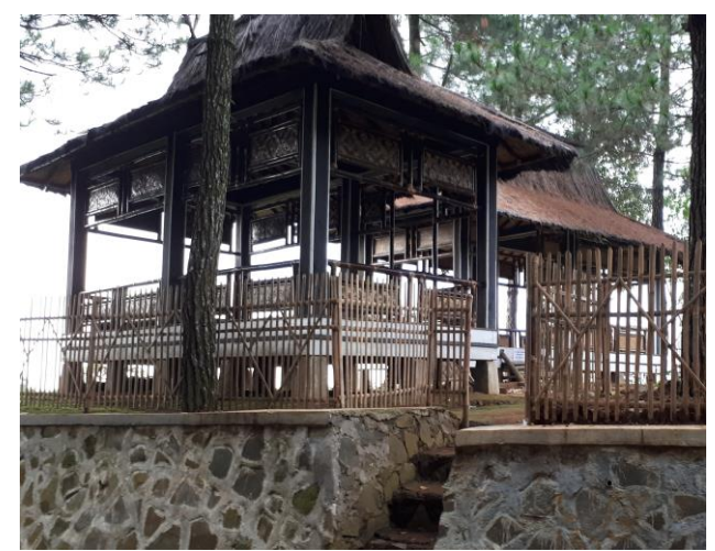
Fig. 7 Saung Sinyal

At the entertainment stage, the presence of Saung Sinyal and "Selancar Lumpur" is unique entertainment.