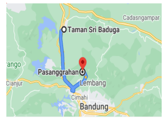
Fig 4. The location of Sri Baduga Fountain, Alun_Alun Purwakarta, and Bale Panyawangan Museum leads to the Kampung Tajur Tourism Village in Pasanggarahan Village

The Sri Baduga Fountain was designed in 2013 and opened in 2017. The fountain has a jet of water as high as 6 meters and is followed by a variety of colored laser lights. This is the most famous tourism destination in Purwakarta and is classified as a special tour by Inskeep (Swarbrooke, 2002).