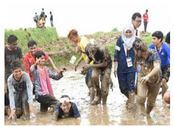
Fig.8 Selancar Lumpur

Domestic transportation and communication. The journey from the village head office to the Kampung Tajur Tourism Village is approximately 1 km away and can be reached by private car. But you have to be careful, since the width of the road is only enough for one vehicle, so if you bump into any cars, you have to turn around. If you don't bring a private car, you can call the tour activist Mrs. Rini to ask her to pick up a motorbike. The expense is 10,000 IDR. Some of the roads are paved, but some of them are still rugged. The path is steep, and in some areas there is a steepness of up to 45 degrees. Rental motorbikes are highly eligible to ride motorbikes, and their attitude is very pleasant. The skills and attitudes shown to visitors make the visitors to revisit [18].