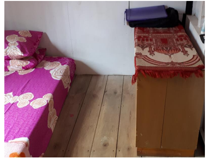
Fig.9 Bedroom in Homestay

There are 43 homestays in Kampung Tajur Tourism Village. Each homestay has two rooms for rent. For school students, typically in 1 house of around 8(eight) students. Each room has a bed or a mattress and a small wardrobe. Every homestay has reasonably clean bathrooms and toilets. There is no need for a cooling system in the room since the air is cold enough to be about 20 degrees Celsius. The photo of the homestay is shown in Figure 9.