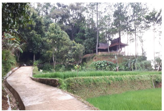
Fig.12 Clean environment

with the definition of efficient and accurate service or reliability [6][16][17]. The hosts felt that helping others would be compensated by Allah's S.W.T. With regard to the tangible dimension, local people always maintain the cleanliness of their environment and their homes. Local people clean the environment together every week, such as waterfalls, rivers, waterways, signal huts and pathways. Figure 12 shows the village road that is always kept clean. The attitude of mutual cooperation shown by the village community shows that the village community has a strong social capital[12]. Social capital owned by the local society is one of the assets to respond to a range of changes in a sustainable manner. [11]. As for the houses, they're cleaning them every day to make the houses and yards look clean. Figure 13 shows one of the houses in the local community.