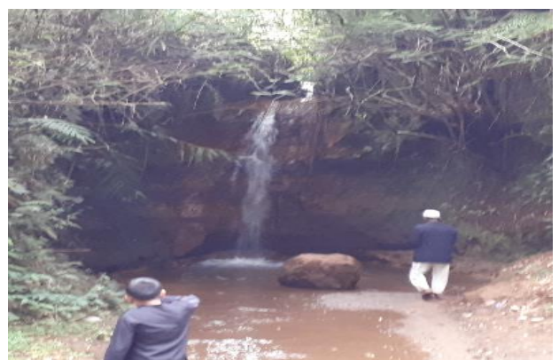
Fig.10 Kahuripan Waterfall

The photo above was taken in September 2020 where the weather is dry and the water discharge is poor. There is typically a significant amount of water in natural conditions. At 10, tourists can see the water playing under the Kahuripan Waterfall. Kahuripan Waterfall is part of the Natural Tourism Community [7].