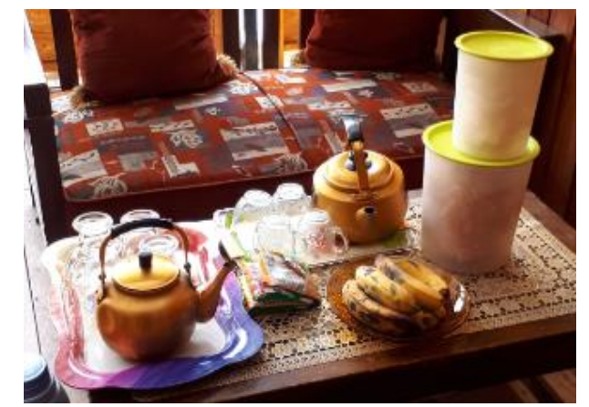
Fig.5 Snack at Homestay: Rengginang and Steamed Bananas