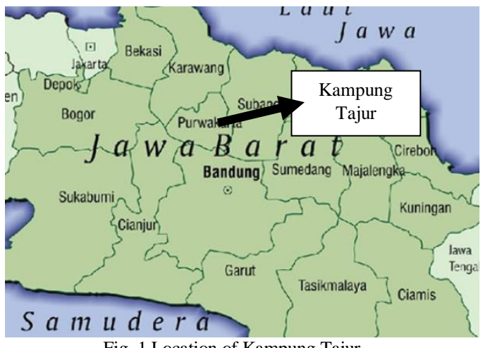
Fig. 1 Location of Kampung Tajur

Visitor are usually teachers and students from schools in West Java such as Jakarta, Karawang and Bandung to the Kampung Tajur Educational Tourism Village. The school organizes students' education in leadership or character building. There are schools almost every day that visit and stay for two or four nights. Students typically live in a homestay in groups (approximately 8 people). There isn't any fixed rate, but on average per visitor to the household, funds are reimbursed to the owners about Rp.200.000, -(USD 14) per building.