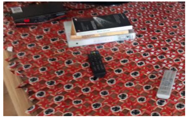
Fig.12 Indoor Activity Recommendation: Weaving Coffee Wrapping Waste

Currently, one of the attacks was the owner of the homestay who was able to make mattresses from waste coffee wrappers. It can be used as an indoor sport. Figure 12 describe indoor activity recommendation of weaving coffee wrapping waste. This activity is an activity with a view to sustainability, since it converts waste into something of economic value as well as of benefit to the conservation of the village environment. This is in line with the spirit of sustainability launched by the United Nations World Tourism Organization [19].