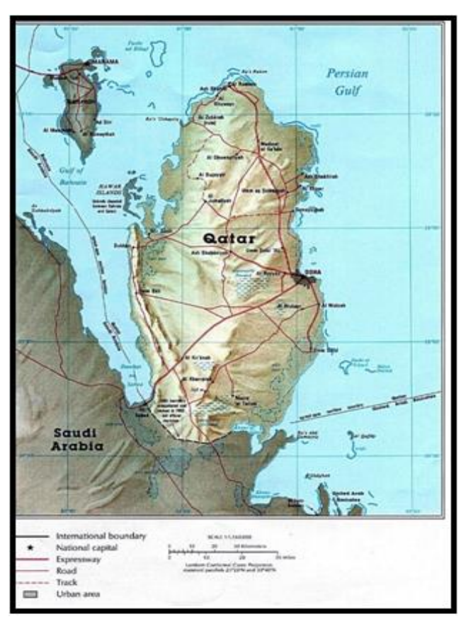
Figure 1: Map of Qatar