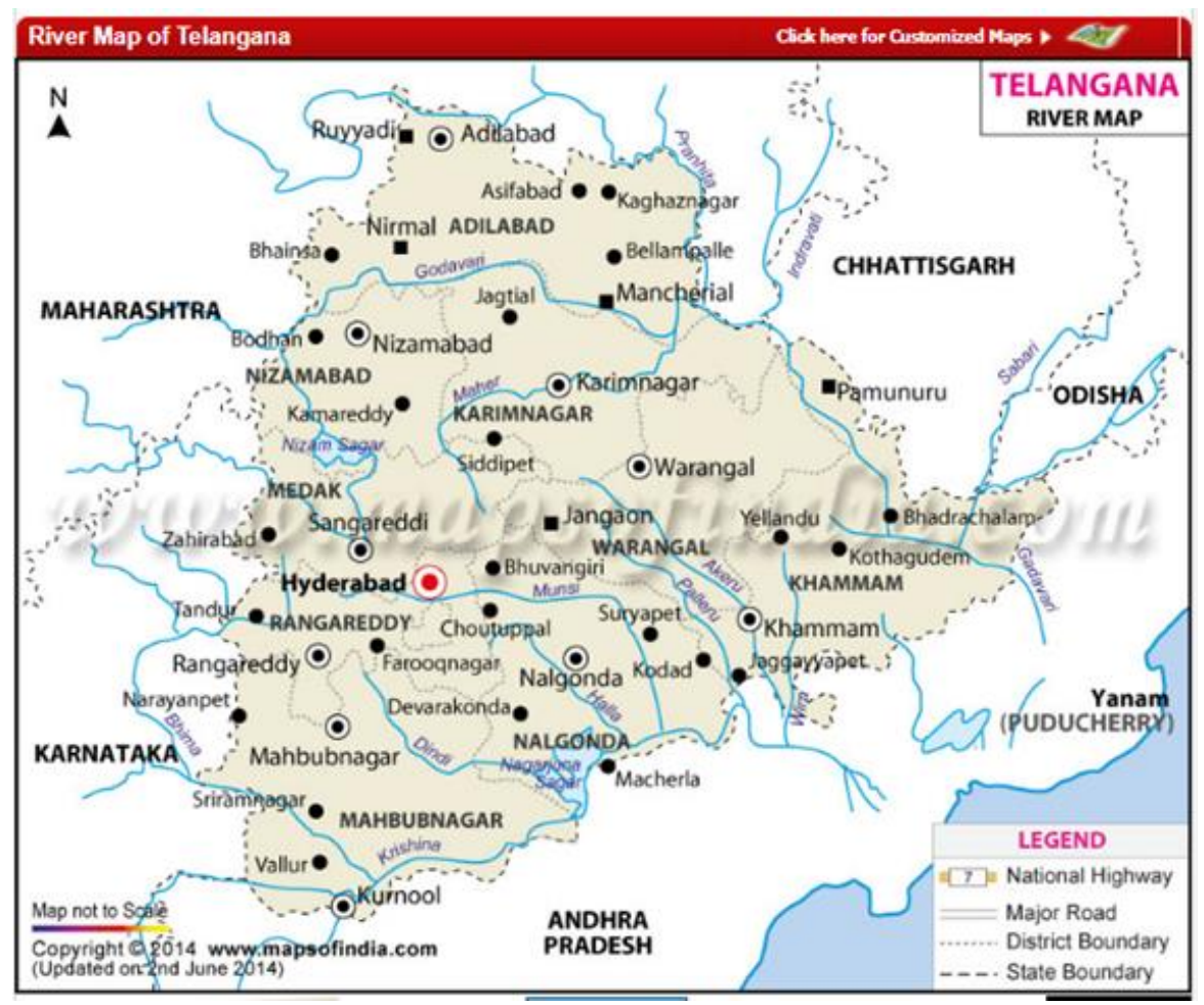
Map 1