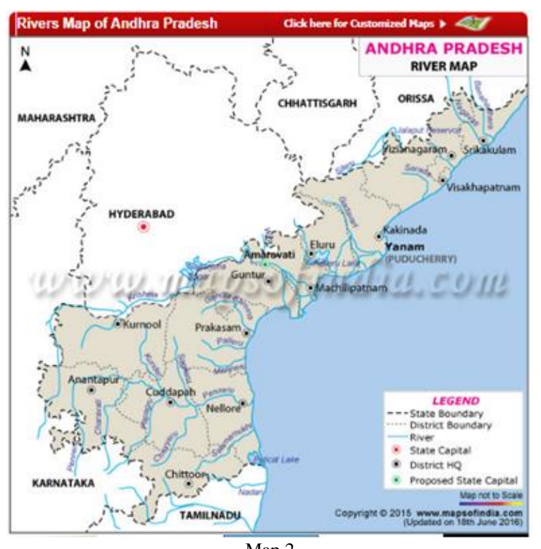
Map 2