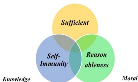
Fig 1:- 3 th mains and 2 nd located conditions issued to the Philosophy of Sufficiency Economy

Pimdee, P., Jedaman, P., and others [5] to presented of Thais' Royal Science or Sufficiency Economy is understood most usefully as a primer to help Thais, especially those with modest assets, to make their way among the largely unfamiliar signposts of globalized markets. It is based on the way and the practice of self-dependence, self-sufficient, modest and realistic including the knowledge and global literacy to use to the development of stable and sustainable. The figure consists of three main features issue to moderation of sufficient, reasonableness, self-immunity, and located on two conditions as; knowledge and moral.