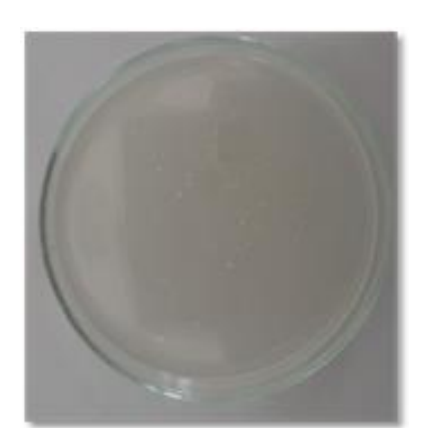
Fig 2:- Petridish 2 (Sample was taken from near hot air oven)