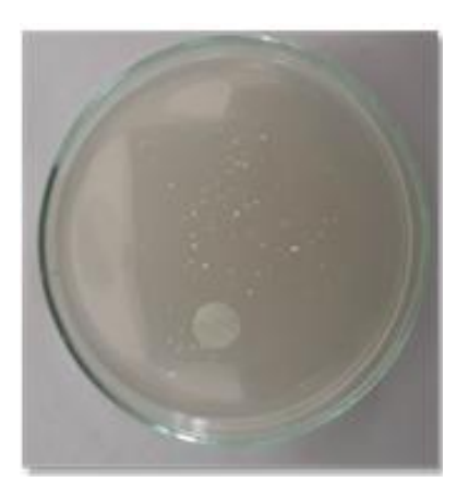
Fig 1:- Petridish 1 (Sample was taken from floor)

After 24hrs when petridish was removed from incubator then it was observed under "Microbial Colony Counter" to find the microbial growth in different petridishes and marked the different colonies formed by the microbial growth.