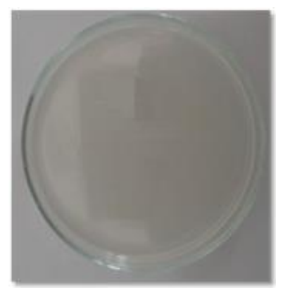
Fig 3:- Petridish 3 (Sample was taken from Laminar air flow bench)