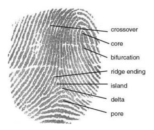
Fig 1:- Finger Print

E. Marasco et al. [1] discusses various issues related to the vulnerability of fingerprint recognition systems to attack the system with artificial fingerprints, where materials such as, silicone, playdoh, and gelatin are inscribed with fingerprint ridges. Researchers have experimented that some fingerprint recognition systems can be deceived/attacked when these artificial fingers are placed on the sensor, the system successfully allowed false/artificial fingerprints. Various anti spoofing schemes are announced to overcome this issue that are hardware-based, several software-based approaches.