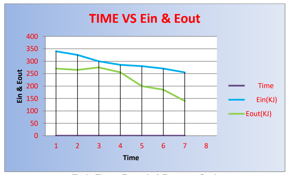
Fig.5:- Time vs Energy in & Energy out Graph