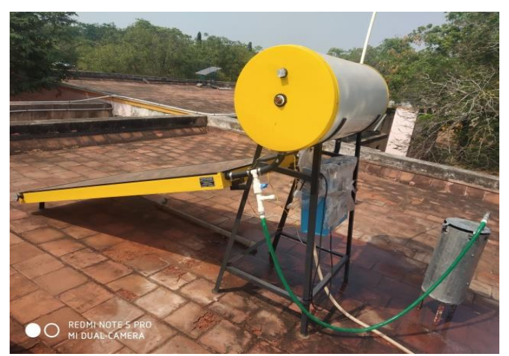
Fig.1:- Energy lab solar water heater connect to the energy storage setup

The test kit was connected to the solar water heater setup at ACGCET college Mechanical department, Energy lab.