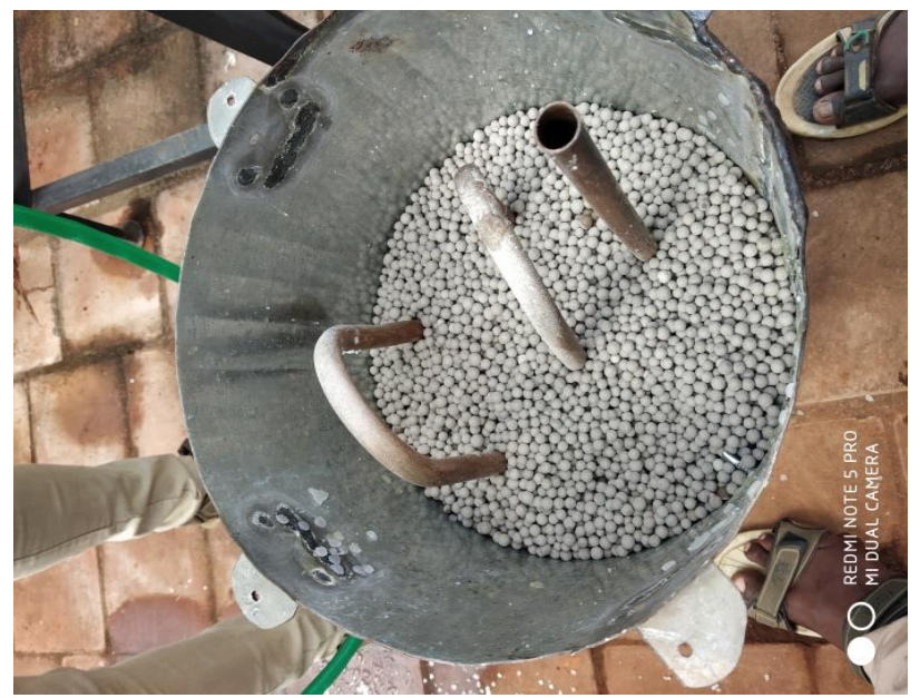
Fig. 2:- Energy storage setup filled with energy storage material(Zeolite)

The test kit was connected to the solar water heater setup at ACGCET college Mechanical department, Energy lab.