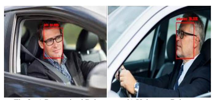
Fig 3:-a) Recognized Driver

Face recognition systems use computer algorithms to pick out specific, distinctive details about a person's face. These details, such as distance between the eyes or shape of the chin, are then converted into a mathematical representation and compared to data on other faces collected in a face recognition database. Based on the information received from the face recognition the driver can be identified as an existing user or a unknown(new user).