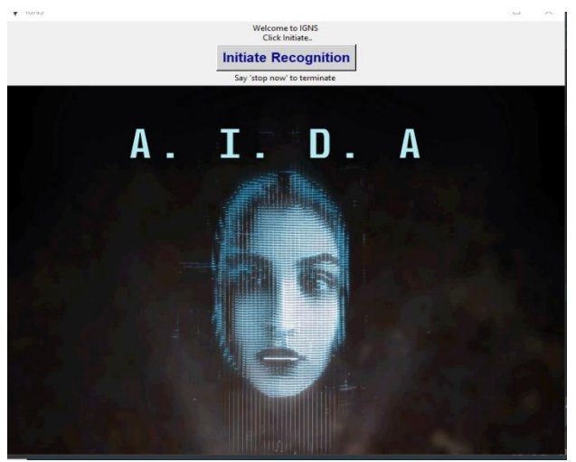
Fig 2:- user interface of virtual assistant