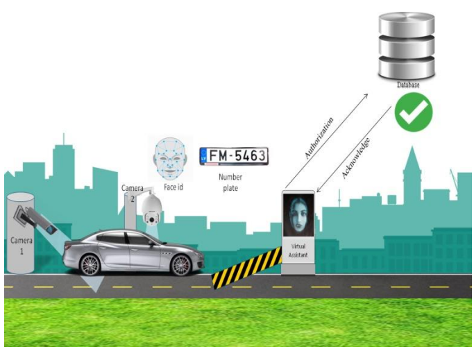
Fig 1:- Overview of the proposed system

IGNS security system strives for automation hence the entire system control is based on the guidance of an Artificial intelligence or Virtual Assistant named A. I. D. A (Advanced Intelligence in Decision and Action) which enhances interaction with the driver.