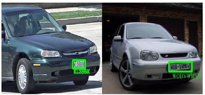
Fig 4:- Vehicle Recognition