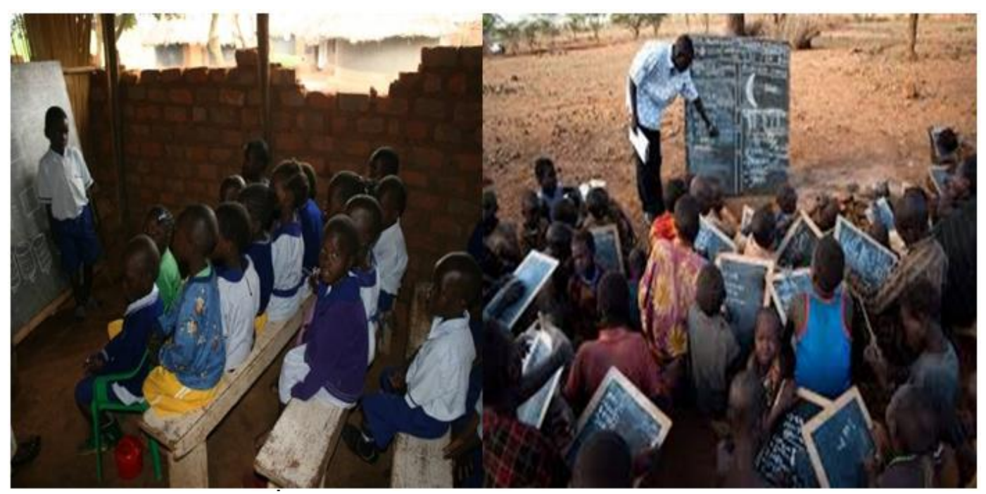
Fig 2:- (This is pictures that show the situations that used to get education to the poor children in Africa especially Developing countries like Tanzania, Togo, Zambia.)

Due to the trend of complete primary level in Tanzania children from poor family have low in completing primary school. Because parents did not allow their children to go in school so, but for some extent now parents allow their children whist there is low influence of parent because they use children as labor force in different activities. For example cultivation and find pasture for animal.