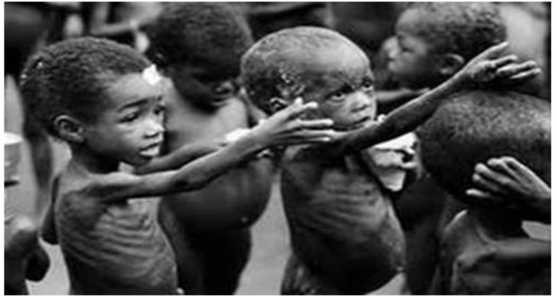
Fig 1:- The picture that show children who affected by malnutrition diseases in poor family in Africa

In poor families, children face diseases caused by lack of balance diet. Many malnutrition diseases caused by eating one type of food that produce once nutrients. Mostly in poor family eat starch food like ugali, rice only without mixing of other important nutrients like protein, vitamin, iron and others. Inadequate balance diet creates health related problems such as; goiter stunted and blood pressure. Globally millions and millions of people are suffering from malnutrition, although life style, environmental, occupation and cultural practice dictate the type of malnutrition. Generally under consumption of calories are found to poor, while overconsumptions of calories are found to rich people.