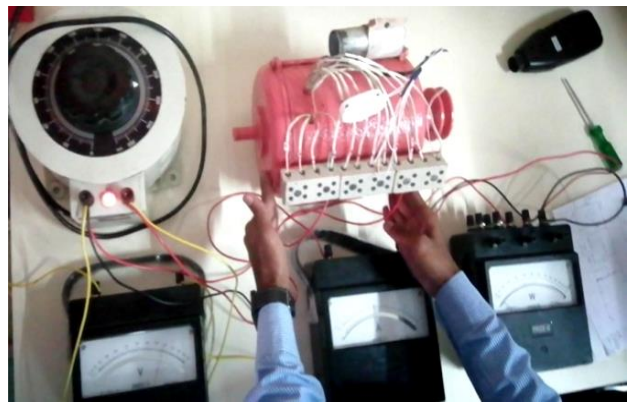
Fig 8:- Single Phase No load and block rotor test setup

By using single wattmeter method with Multiplying Factor 4, No Load Test and Block Rotor Test done on single phase machine