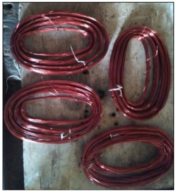
Fig 4:- Running coils of Single phase winding

design is measured by the device called 'FARMA' The original motors coil group is brought out from the motor and then the farm is adjusted and fitted manually. Once farma is adjusted as our requirement, now anyone can able to do further single layer or double layer groups on farma.