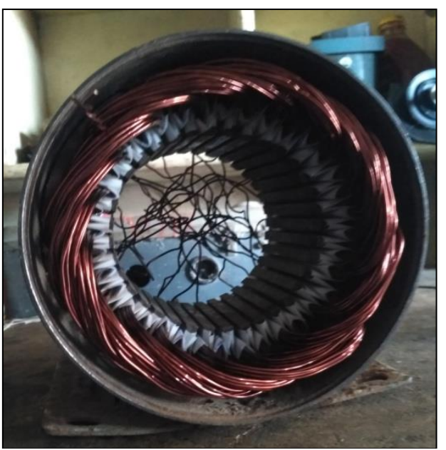
Fig 3:- Three Phase winding insertion

➤ Hardware Implementation of Single phase Winding Design