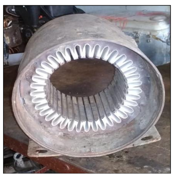
Fig 2:- Empty stator core and casing