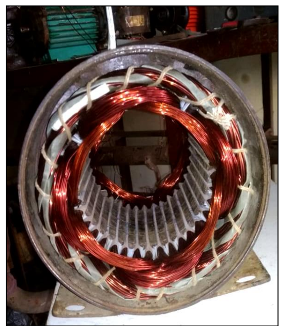
Fig 5:- Three Phase and Single phase starting running winding insertion