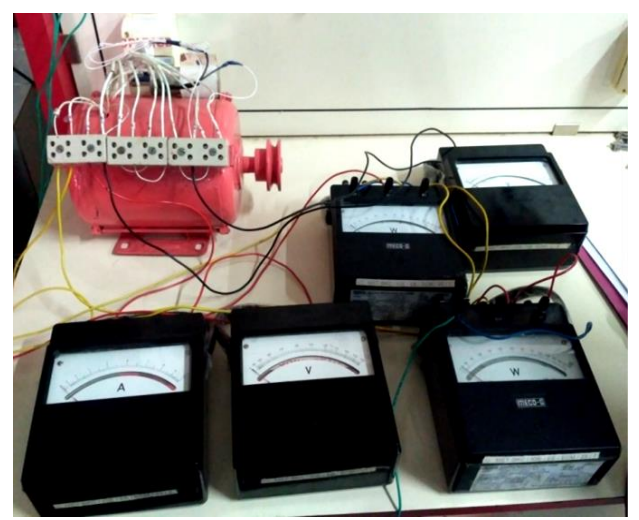
Fig 7:- Three Phase No load and block rotor test setup

As shown in test setup no load and block rotor test carried out on 3 ph machine by using conventional Two wattmeter method with Multiplying Factor 4, for calculation of efficiency of motor.