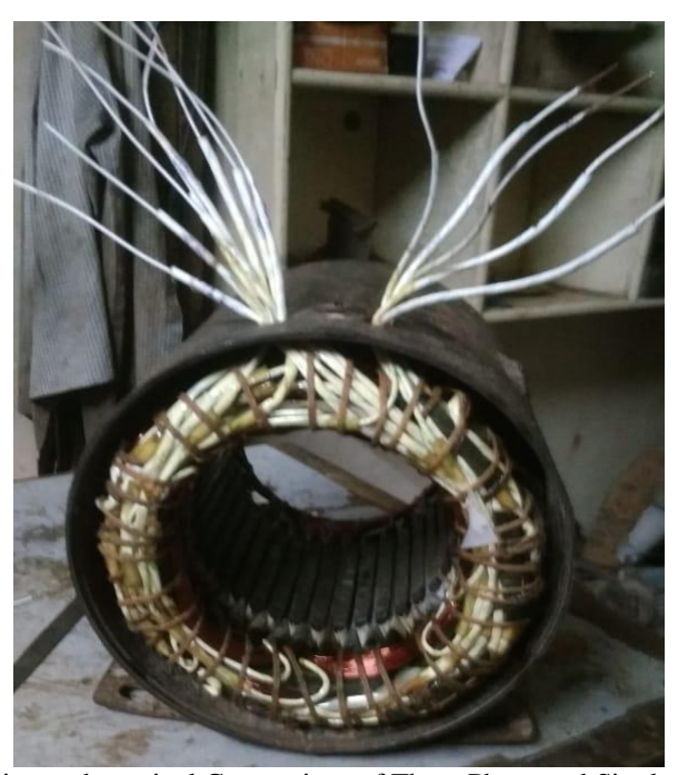
Fig 6:- Varnishing and terminal Connections of Three Phase and Single phase winding