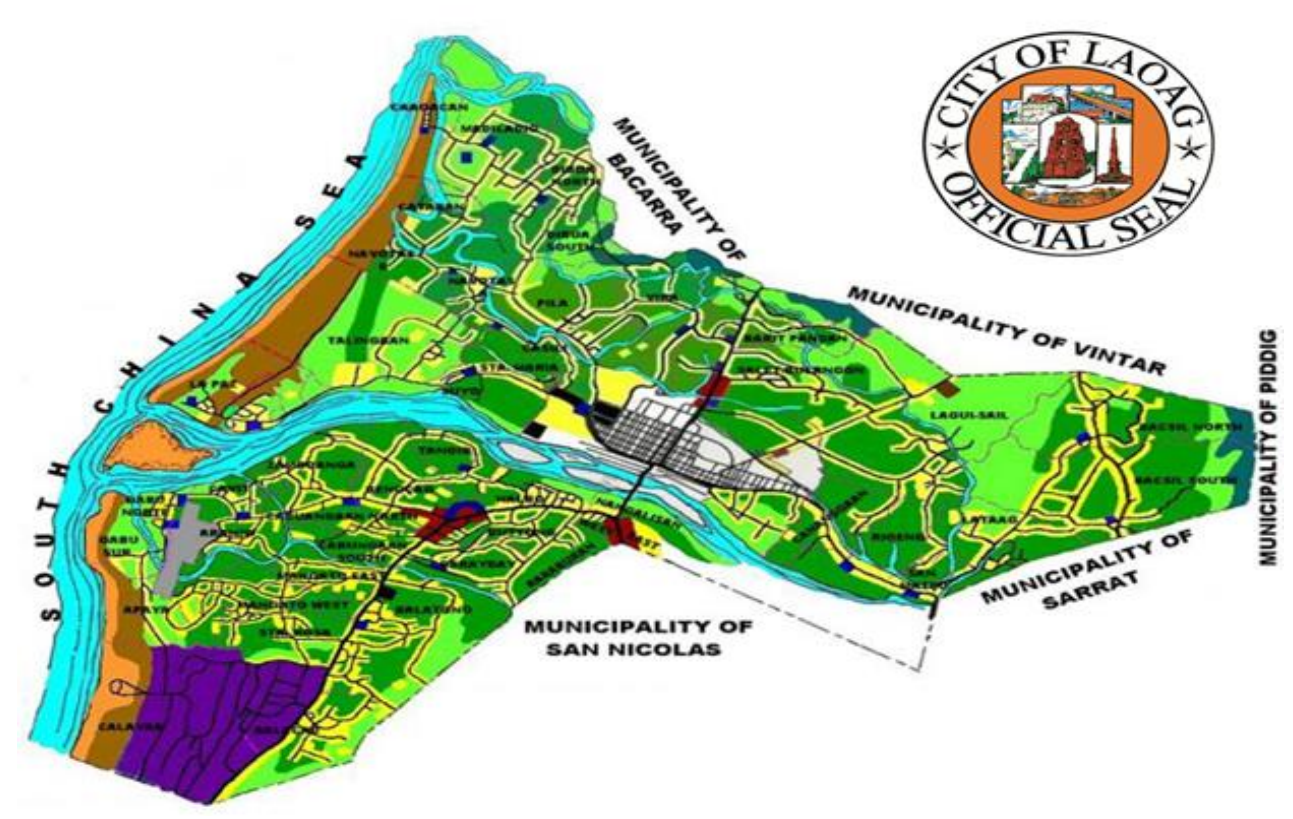
Figure 2. Map of Laoag City, Ilocos Norte

taken based on the specific purpose (Arikunto (2010:183). Simply put, the researcher decides what needs to be known and sets out to find people who can and are willing to provide the information by knowledge or experience (American Journal of Theoretical and Applied Statistics 2016). Hence, the PNP of Laoag City Police Station were chosen purposively as the primary participants considering that these police officers are the first-hand implementers of e-policing in their respective units and community people coming from Laoag City as the secondary participants for a reason that they are used to determine the validity of the data gathered. Provided below is the map of Laoag City, Ilocos Norte.