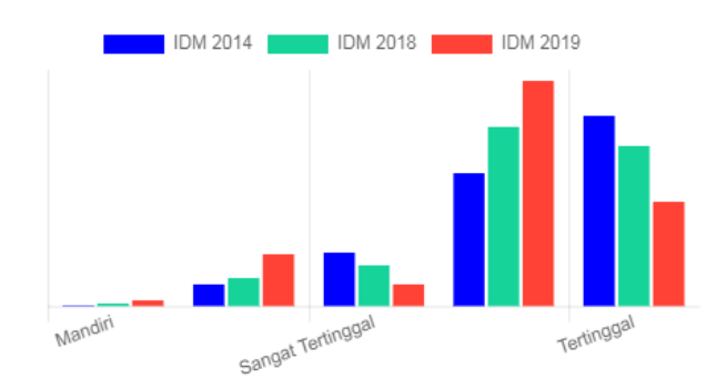
Fig 4:- Mandiri Village Index (IDM)