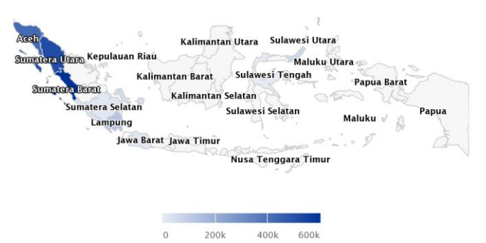
Fig 3:- rural areas in Indonesia

Village Government is an extension of the central government which has a strategic role to regulate the people in rural areas in order to realize government development (Rohrer, Egloff, & Schmukle, 2017). Based on this role, the Regulations or Laws relating to the Village Administration that govern the Village Government will be issued, so that the wheels of government-run optimally. Village Government consists of the Village Head and Village Officials, which includes the Village Secretary and Other Instruments. The organizational structure is as follows: