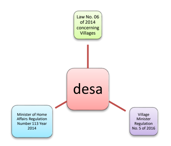
Fig 1:- the relationship between regulations and the village