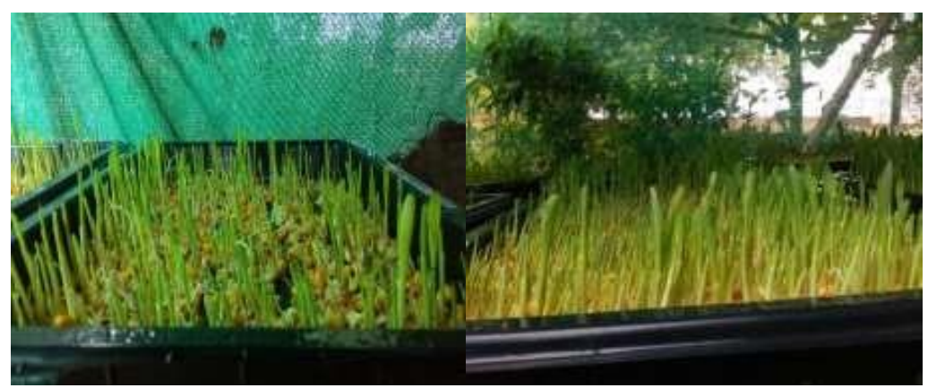
Fig 7:- Third day on tray 29/7.