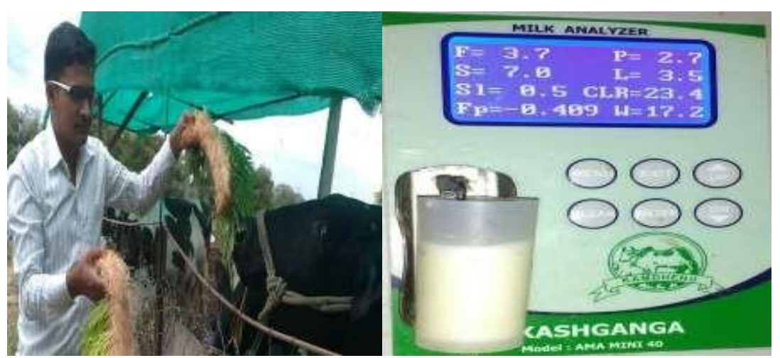
Fig 15:- Feeding of cattle.