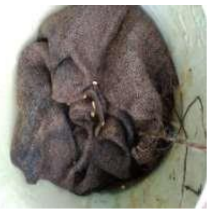
Fig 4:- Soaked seed in gunny.