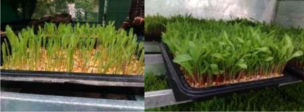
Fig 9:- Fifth day on tray 31/7.