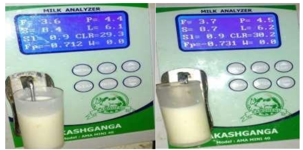
Fig 17:- Quality 13/8 after feeding HMF.