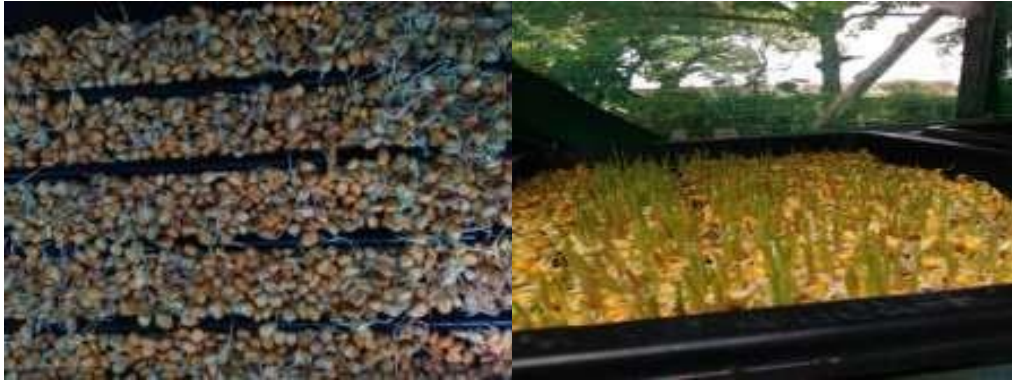
Fig 5:- First day on tray 27/7