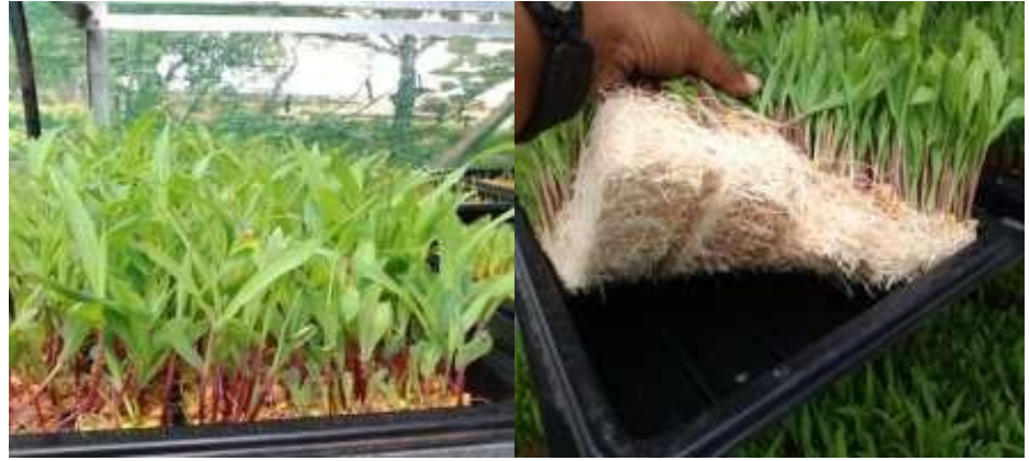
Fig 11:- Seventh day on tray 2/8