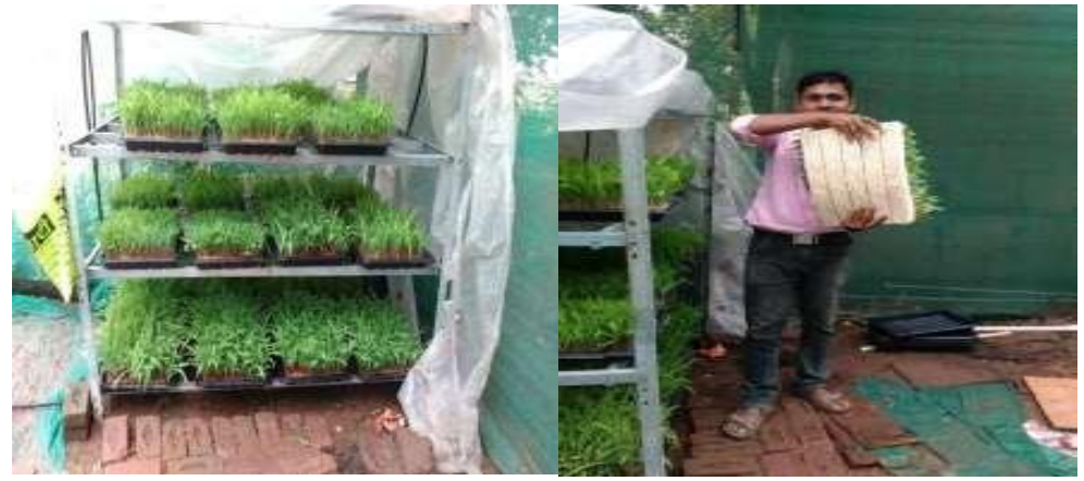
Fig 13:- Eighth day on tray