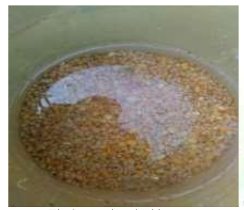
Fig 3:- Seed soaked in water.