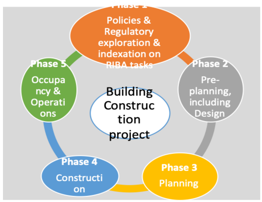
Fig 3:- Phases of the FFIBPLR

approved internationally and endorsed by powerful organisations such as the British Construction Industry Council (CIC). The adopted phases aimed at providing step by step guide to stakeholders of the build environment and establish greater cohesion and collaboration amongst them knowing that this would lead to an effective delivery of the government building policies. The 5 phases work together to generate the final output as shown in the below diagram